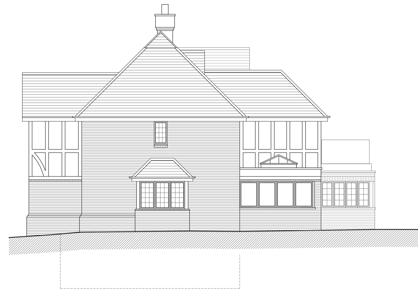
Proposed Right Flank Elevation (East Facing) SCALE 1:100