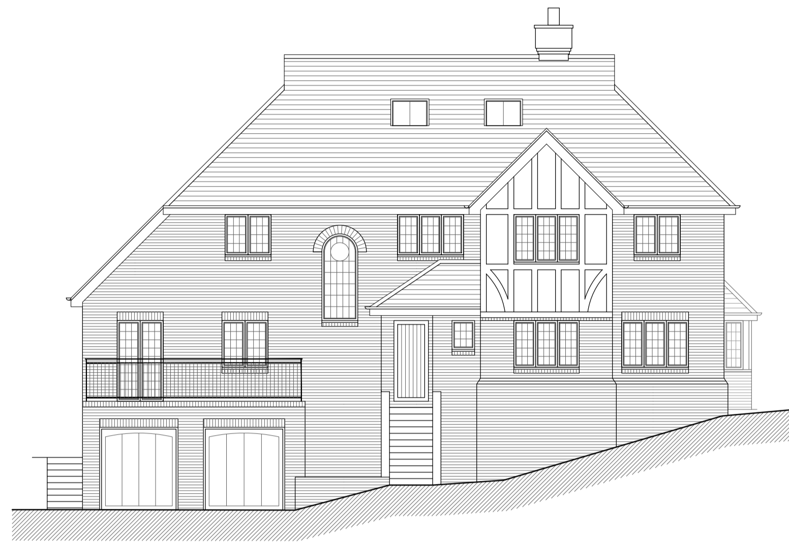
Proposed Front Elevation (South Facing) SCALE 1:100