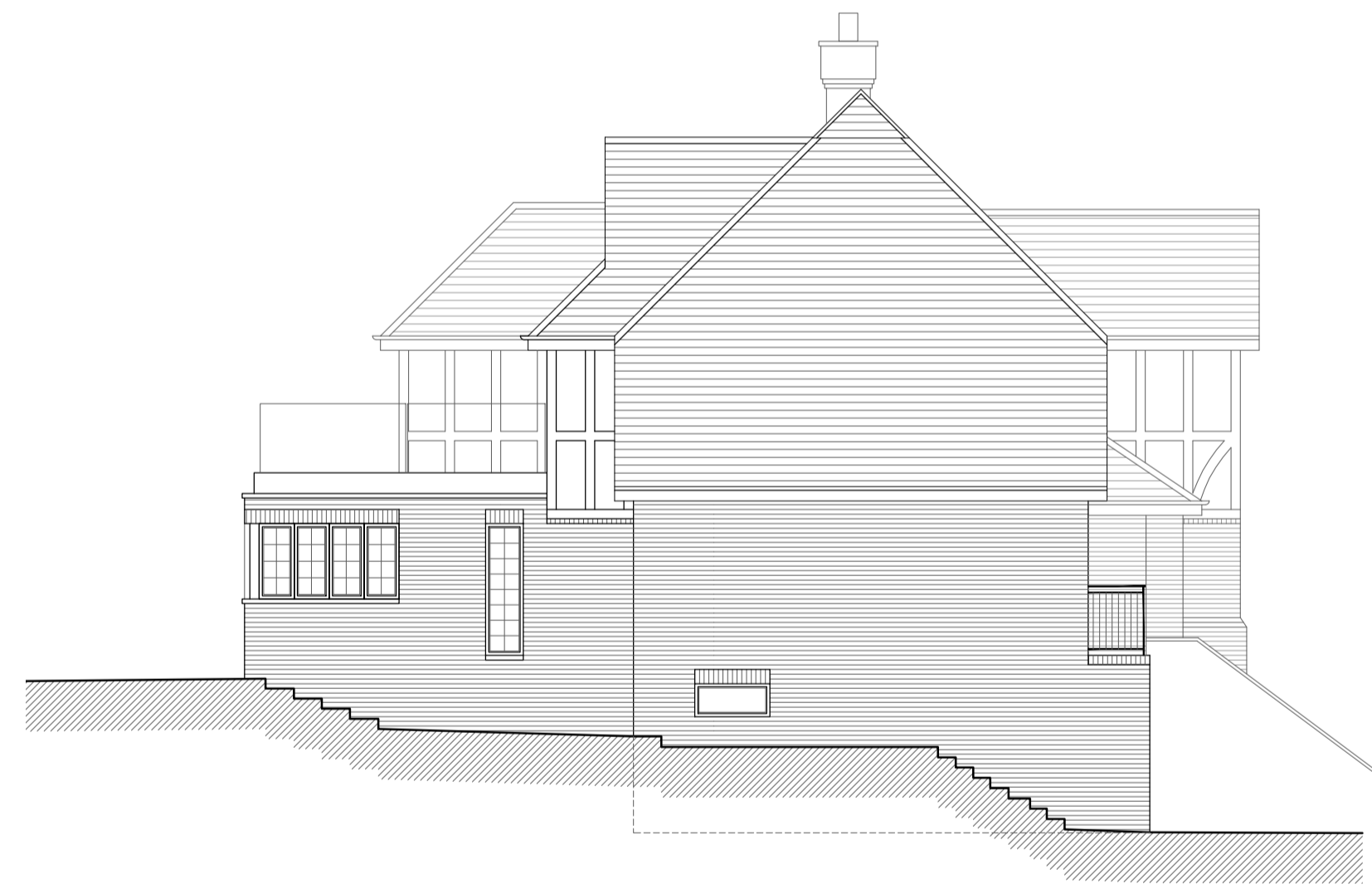
Proposed Left Flank Elevation (West Facing) SCALE 1:100