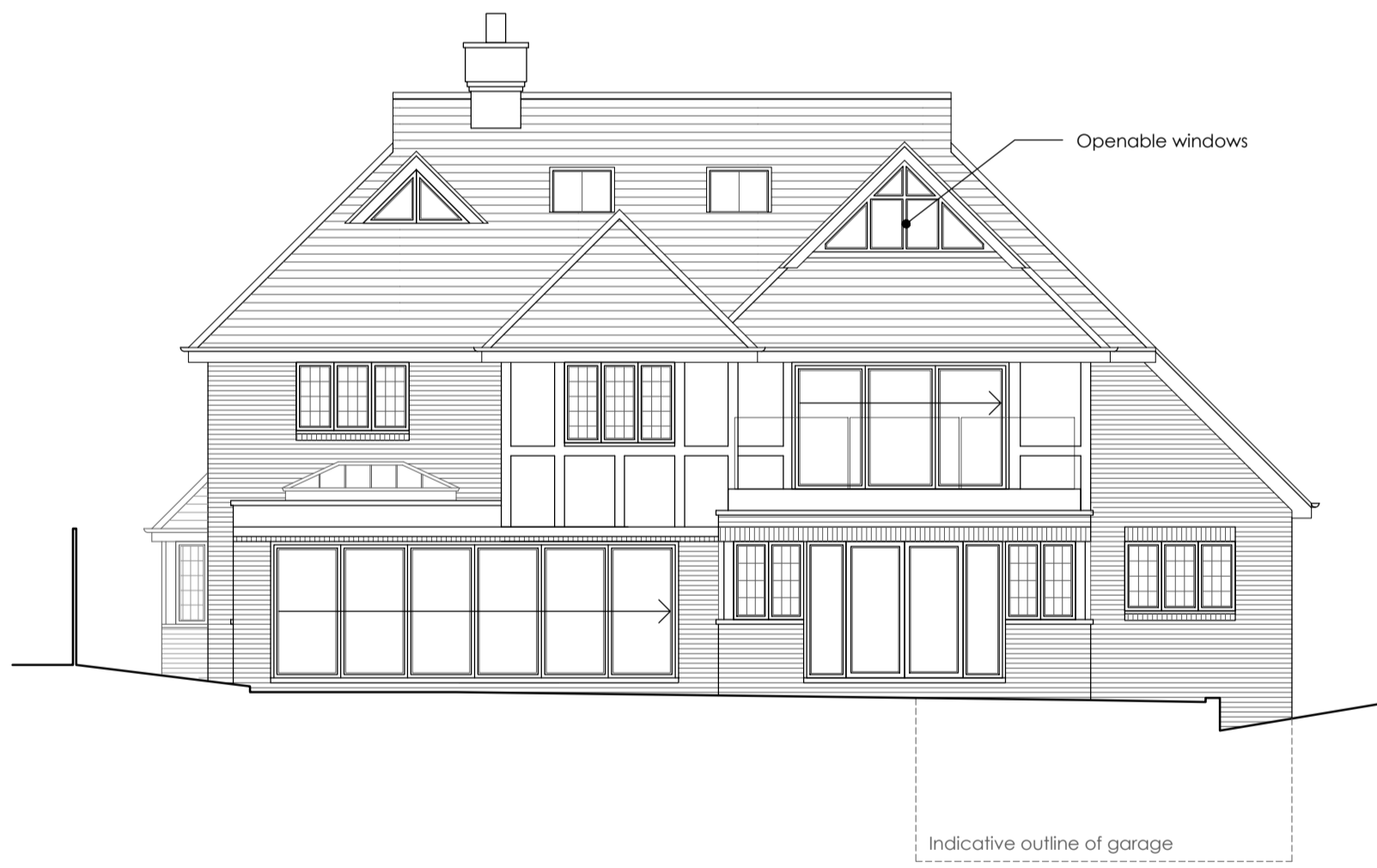
Proposed Rear Elevation (North Facing) SCALE 1:100