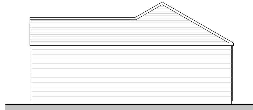
Proposed Side Elevation Scale 1:100