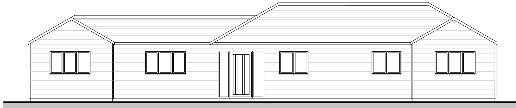
Proposed Front Elevation Scale 1:100