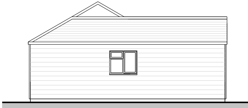
Proposed Side Elevation Scale 1:100