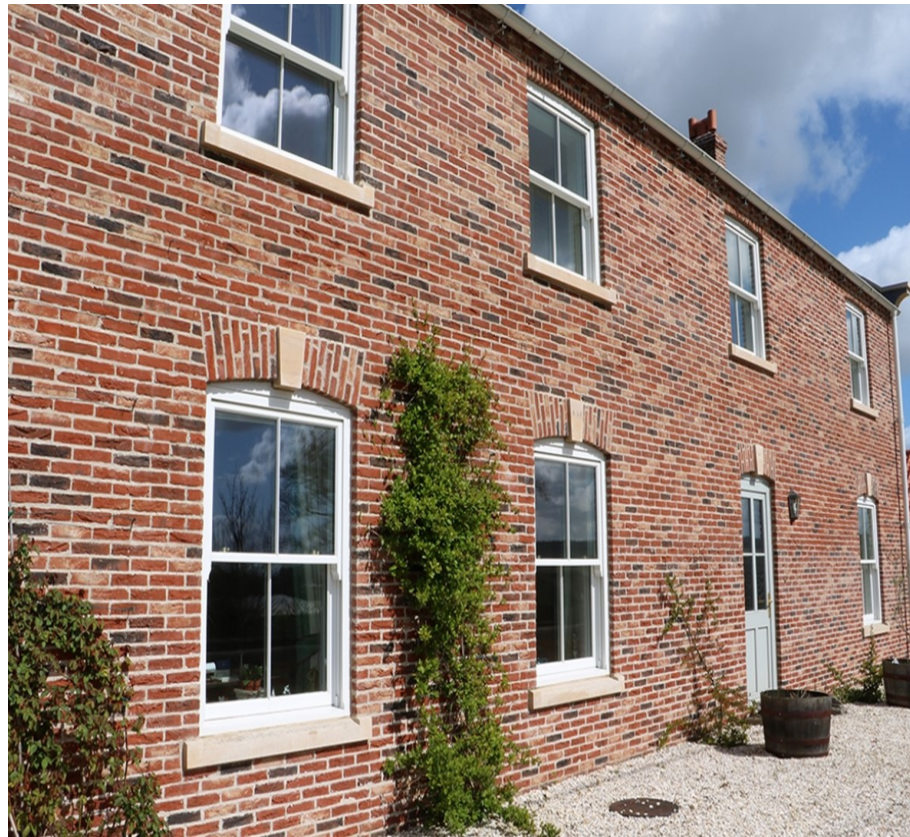
Crest Bricks - 'Old Anglian' Brickwork