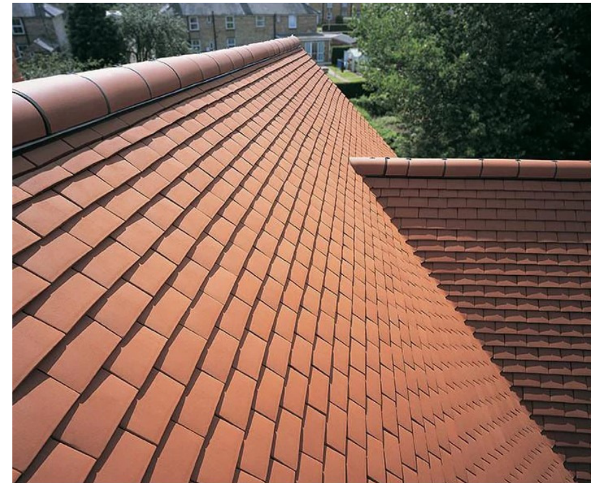
Wienerberger Roof Tiles - Sandtoft 'Humber Tuscan' Clay Plain Roof Tiles