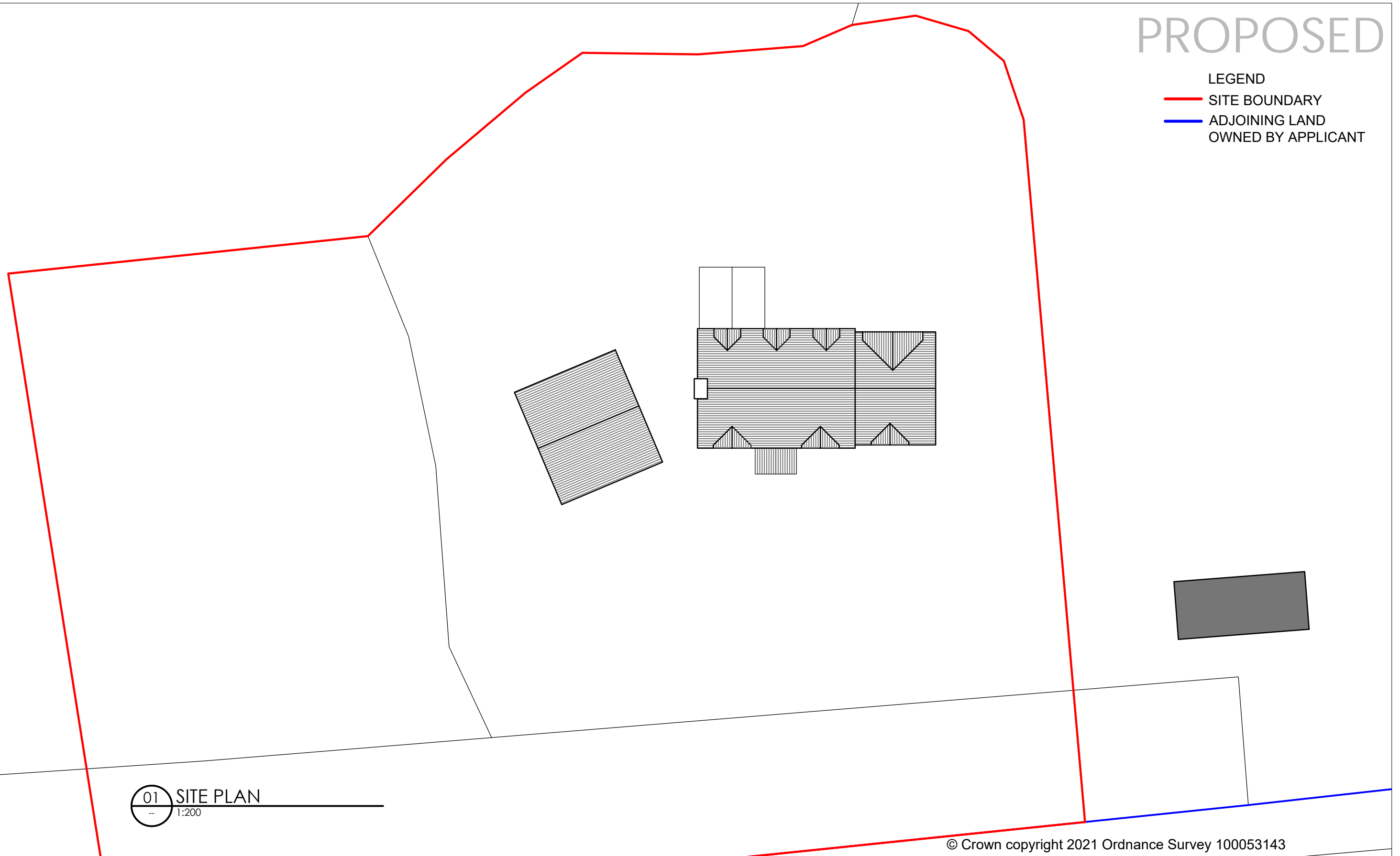
01 SITE PLAN 1:200

© Crown copyright 2021 Ordnance Survey 100053143