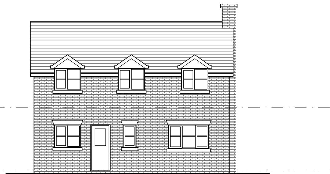
04 SOUTH ELEVATION 1:100