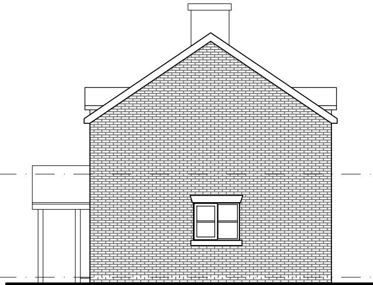
01 EAST ELEVATION 1:100