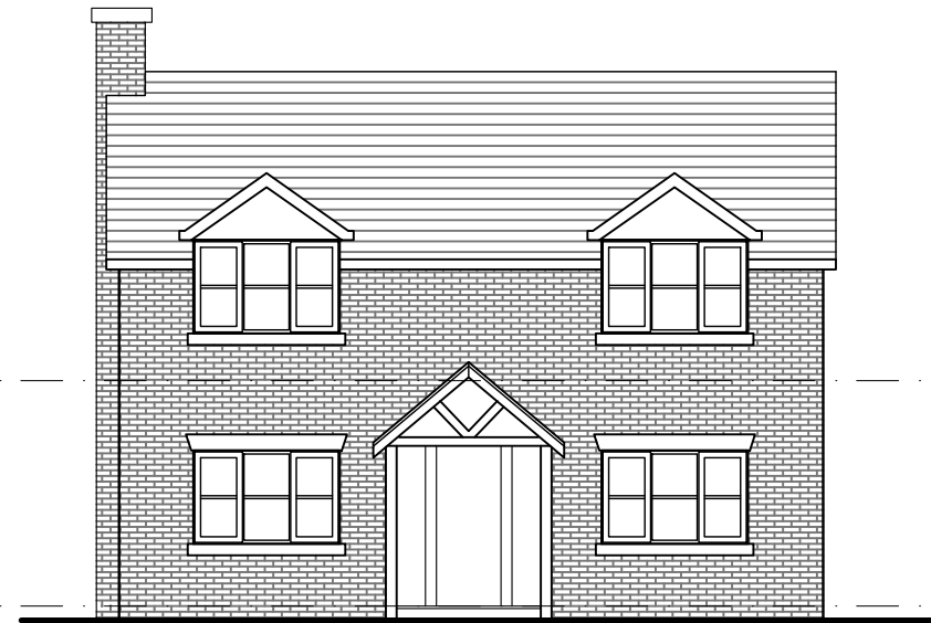
02 NORTH ELEVATION 1:100