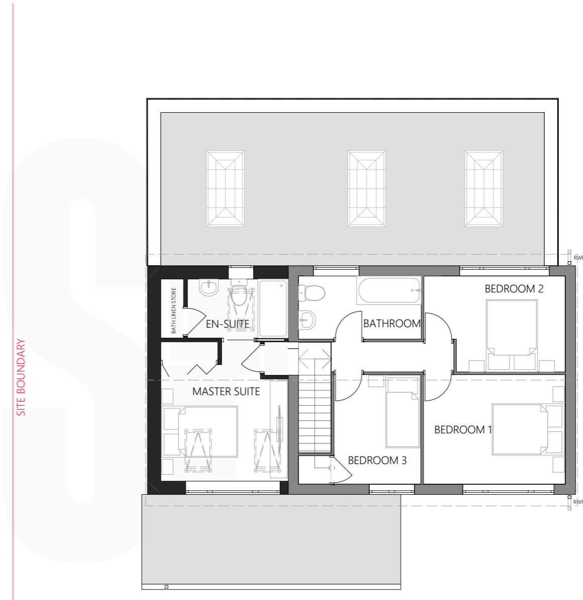
Proposed First Floor 1:100