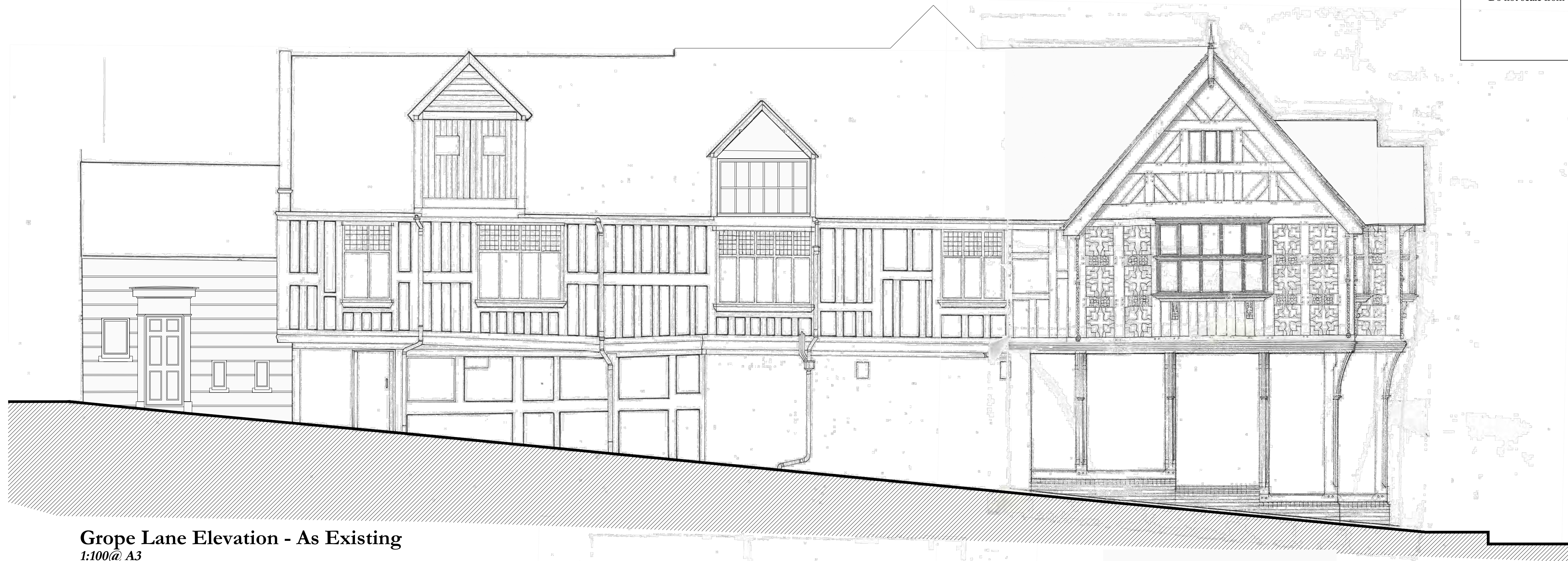
Grope Lane Elevation - As Existing 1:100 @ A3

Do not scale from drawing all dimensions to be checked on site prior to commencement.