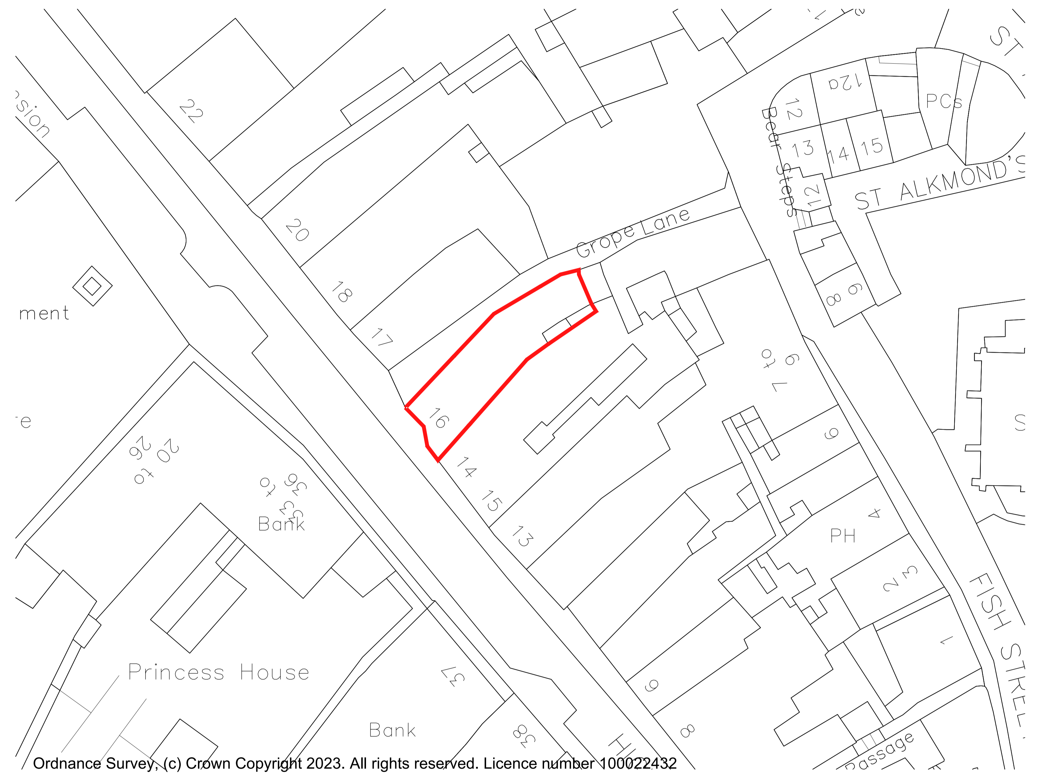
Ordnance Survey, (c) Crown Copyright 2023. All rights reserved. Licence number 100022432 Site Plan - As Existing 1:500 @ A3

NOTES Do not scale from drawing all dimensions to be checked on site prior to commencement.