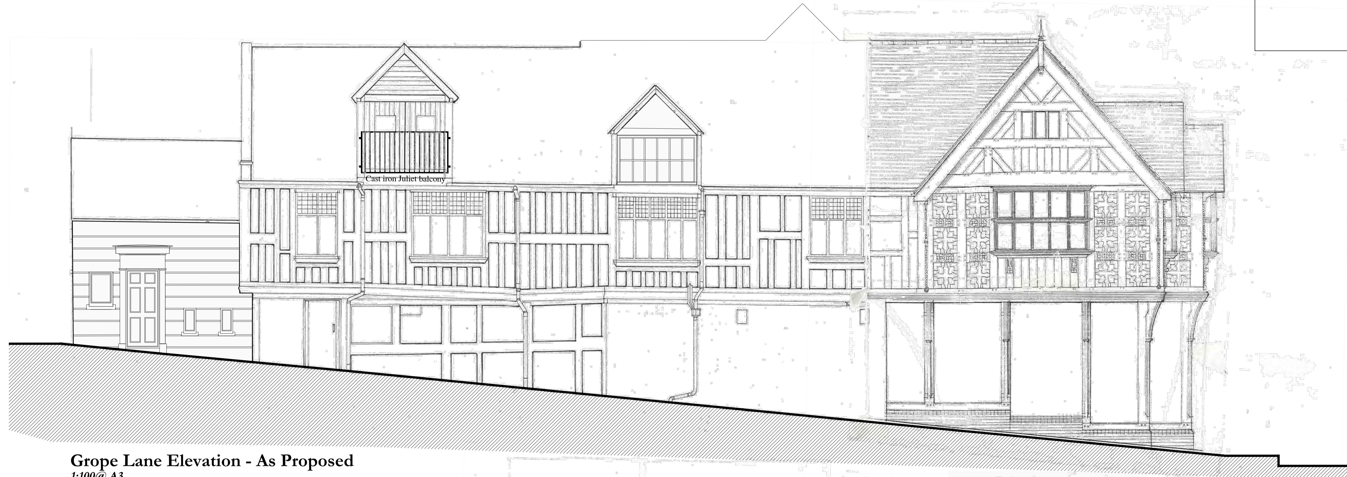
Grope Lane Elevation - As Proposed 1:100 @ A3

Do not scale from drawing all dimensions to be checked on site prior to commencement.