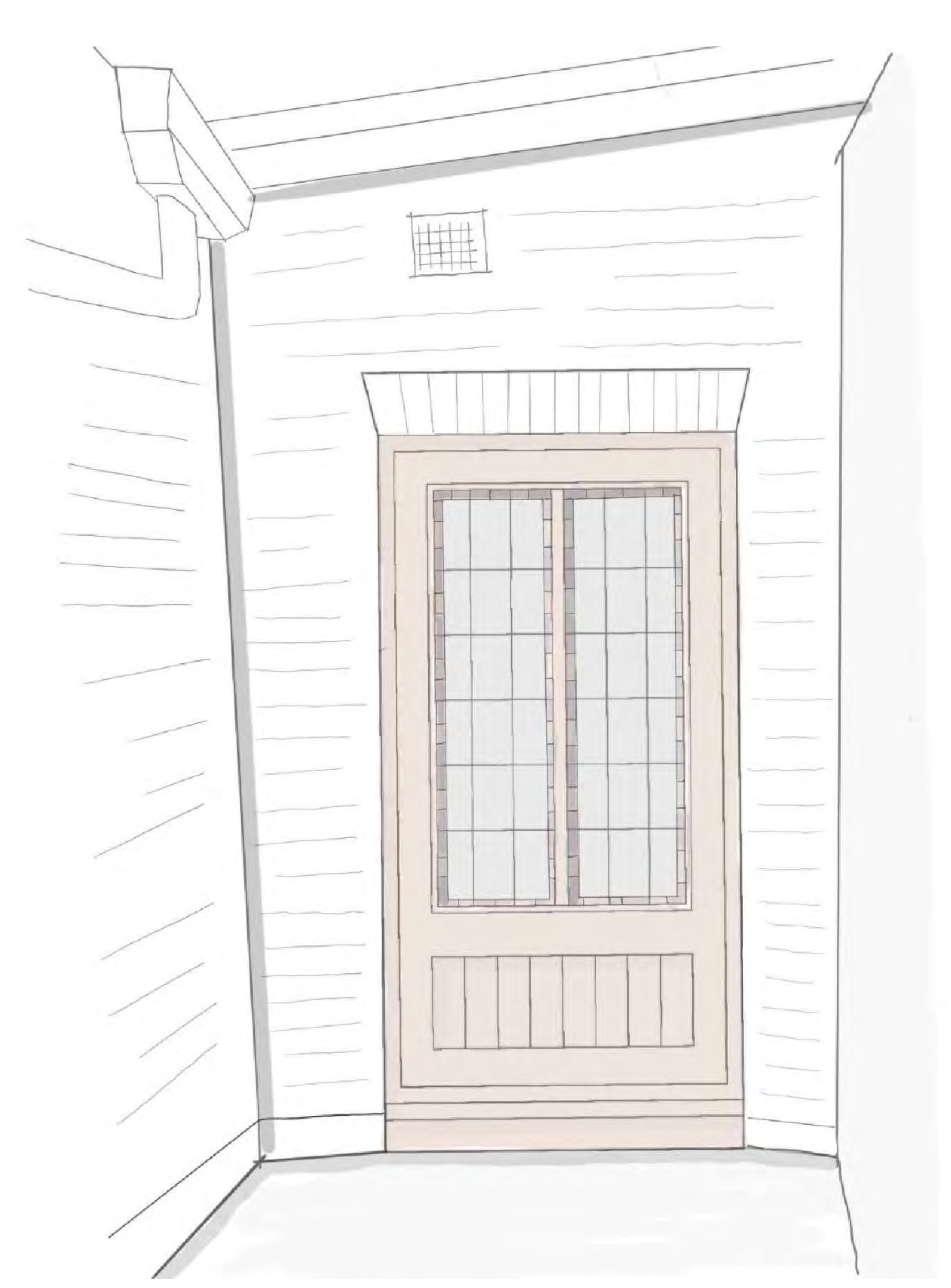
New door access to roof - As Proposed