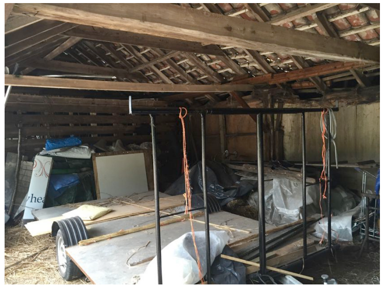
View internally of the northern unit.

Due to the cartlodge affronting the existing access way to the west and neighbouring property to the east gaining sufficient light and external access could be the largest danger of this development. However the proposals have been developed with the historic structure and this in mind. The proposed garden spaces remedy this potential issue well, creating intimate spaces within the development whilst respecting the historic elements of the structure.