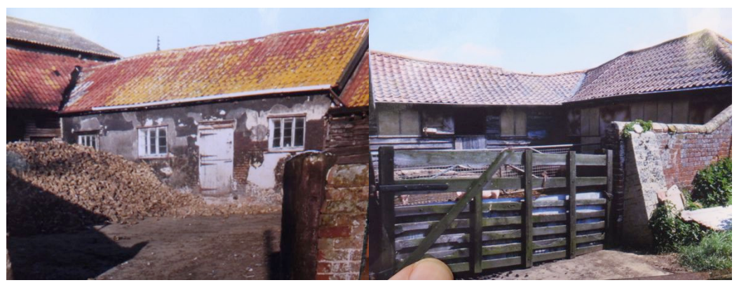
Images from the heritage statement depicting the north easterly wing, of which a skeleton is to be created to show the previous development.

To the front of the barn there are a number of structures that have since collapsed. Where there are elements of these, they will be partially rebuilt to form enclosed garden spaces, terraces and walkways. This will highlight the historical development of the structures on the site and the historical narrative that the site conveys. Without these elements the history of the site would go unknown or unnoticed to prospective users and visitors. To the east of the outbuildings a new ancillary lean-to garden store and greenhouse will be created for garden use, highlighting the nature of the buildings. The existing garage building will be repaired and also used to serve this new dwelling.