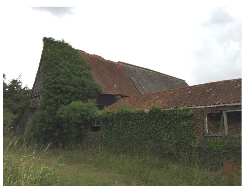
View from south of easterly wing, depicting shallow corrugated steel roof and large brick buttresses to southerly gable.

The existing easterly wing of the barn will remain a secondary element to the barn, providing amenity provisions and enclosed garages and workshops, which again stems from the existing use. The roof has a corrugated steel finish of very shallow pitch, in order to be most true to the buildings development and highlight this area as a secondary amenity space we proposed to replace the corrugated steel with corrugated steel, which will replicate the existing material found on the barn and assist with the reading of its historical development.