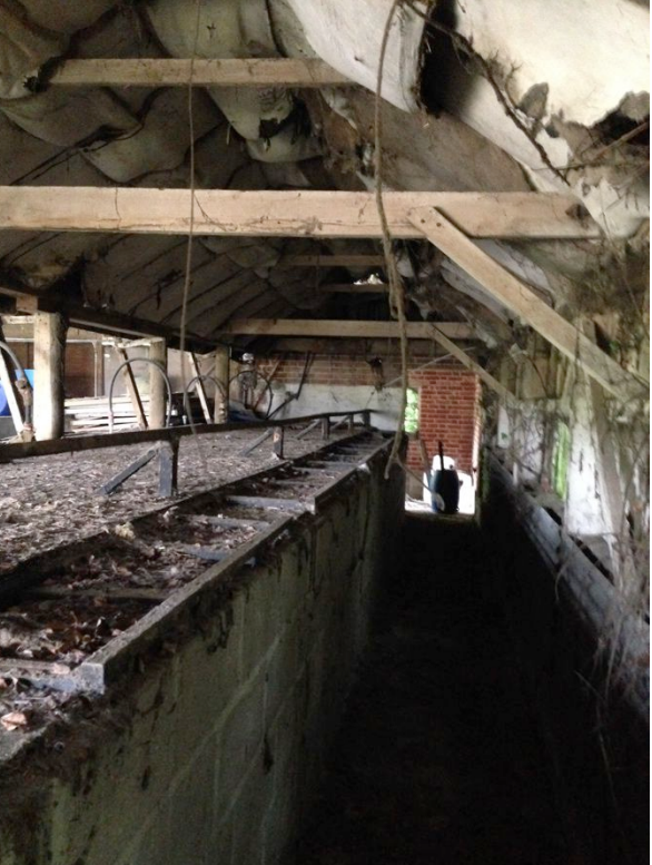
View internally of the piggery with machinery to be removed, note the cast iron profiled guttering which will be repaired and redecorated.