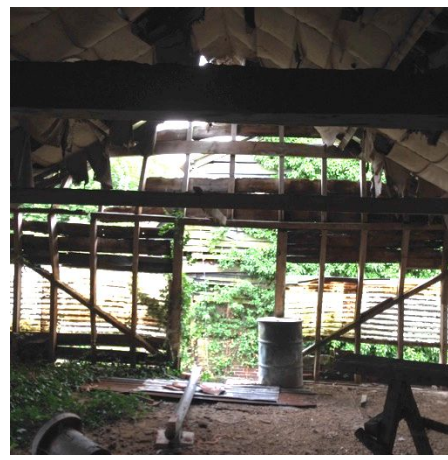
View of the exposed timber frame upstairs.

Where existing brick noggins are present these will be retained and remain exposed internally to fully understand the development of the timber frame.