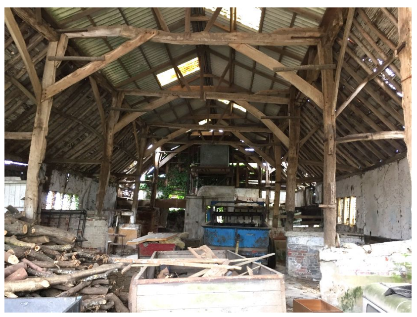
View internally from the south of the barn.