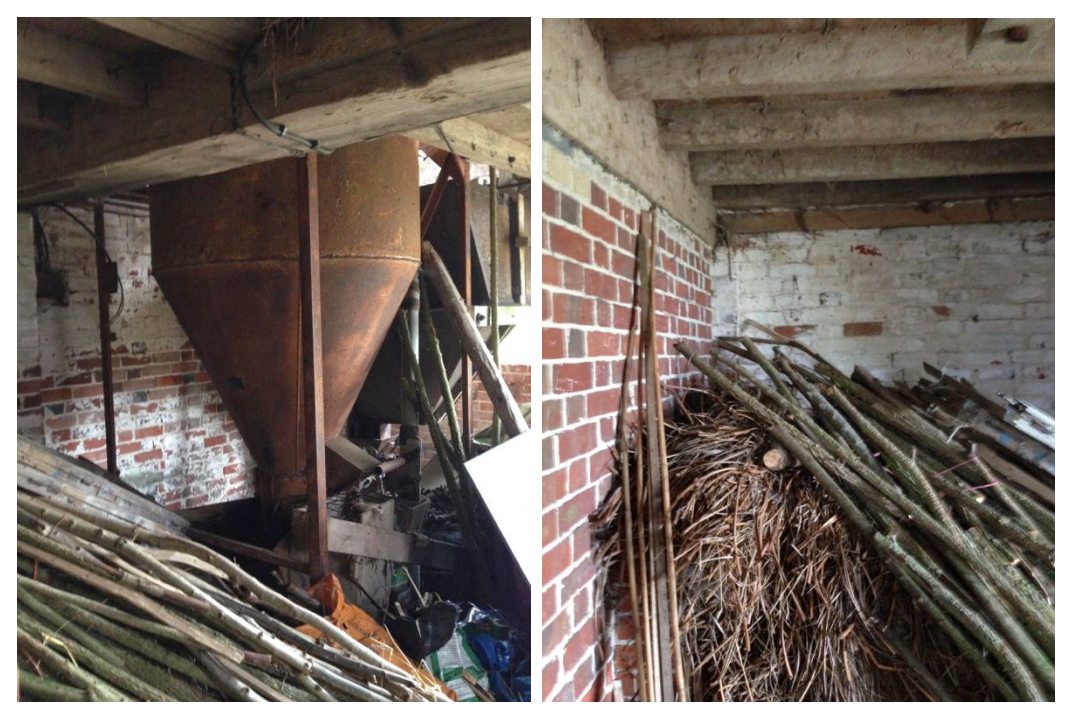
View of the oak floor structure with brick walls to the ground floor.

The design for this barn is slightly different from that of the other large barns. The form of the existing barn is of a more cellular nature to the ground floor and an open larger area to the first floor, the proposals seek to retain and enhance this character: Retaining the open plan nature of the barn upstairs to create the living accommodation and using the enclosed ground floor for bedrooms and bathrooms. This will also provide the best views from the most used rooms. Upstairs the weatherboarding to the timber frame has deteriorated significantly and in many sections it is missing altogether. This is most apparent to the north and east, and south elevations, the proposals will utilise these missing sections of cladding and proposes to glaze these elements. This will provide ample light to enter the large open plan living areas, and also will ensure that the proposal doesn't overlook any of the other barns. Internally, the new staircase and perforations through the floor structure are already created by the removal of the existing hoppers and machinery for the mill (see image above). On the ground floor there will only be 1 new opening to form a window to bedroom 3, all of the others will be existing openings. Where timber boarded doors exist these will be repaired and retained as external shutters.