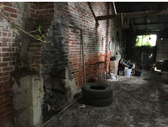
View internally of the southern unit and southerly brick section.

The second, northern unit is of a better construction and the form of which will be retained as it sits currently. The living space will be open plan with a small private courtyard garden formed within the heart of the dwelling. This will allow all of the bedrooms to have natural light and ventilation whilst also creating a feature within the proposal.