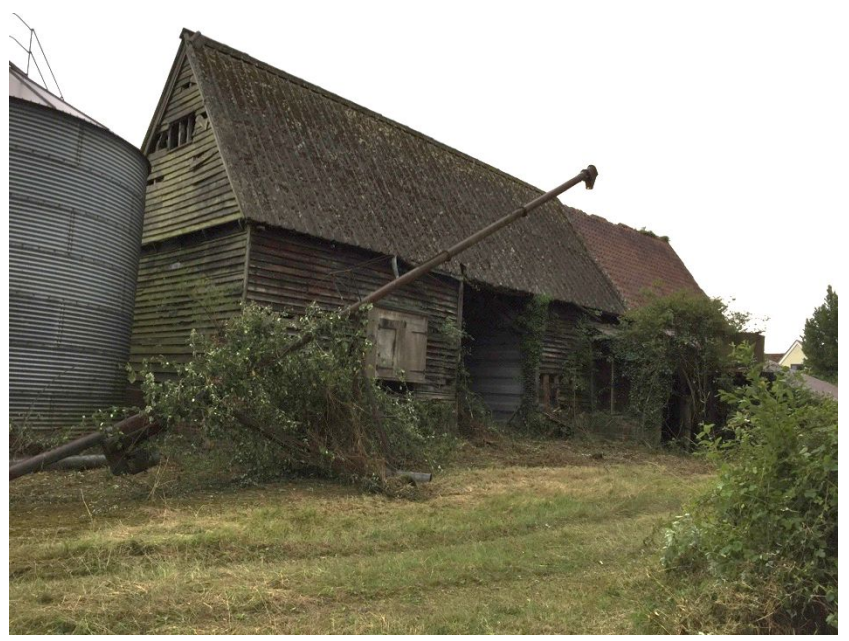
View from the North West.