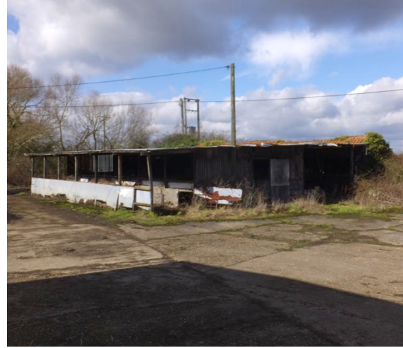
View of the piggery and large corrugated steel flat roof section which is to be removed.