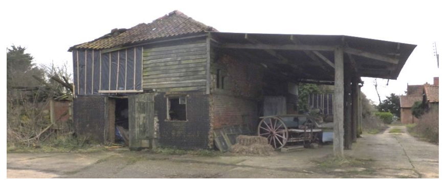
View from the north of the Mill.