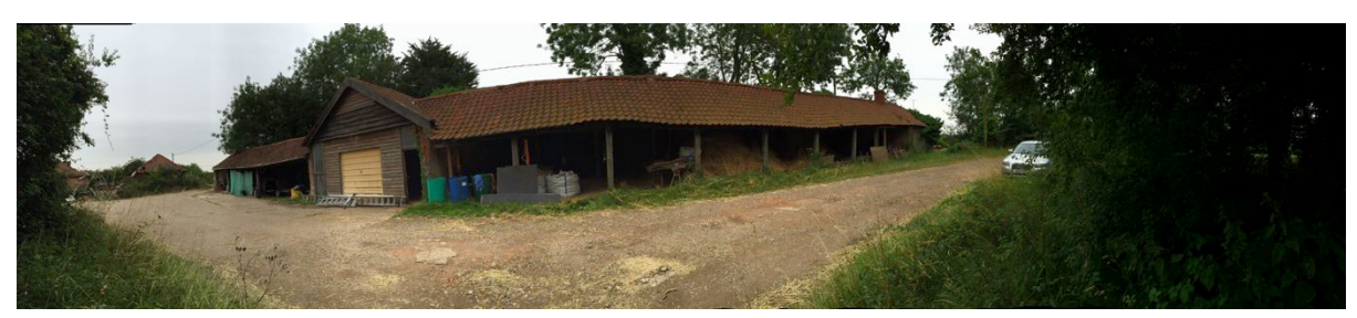
Front elevation of the cartlodge and the existing accessway.