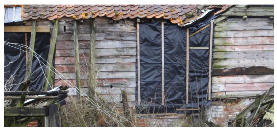
Section of easterly wall previously protected from the elements indicating traces of red ochre

The new weatherboarding as highlighted within the heritage statement will be stained red ochre to match the colour scheme that still has traces of the pigment. This will add to the narrative of the site overall, highlighting the different characteristics and development of each building.