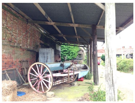
View of the covered overhang.

All of the new glazed elements to the barn will be narrow profiled, large windows and as such will not be domestic in appearance. These new glazed elements will be set externally of the existing timber frame of the barn and so will not materially affect the historic structure. The existing large openings to the barn will be glazed to highlight the existing openings. The external doorways will be timber framed glazed doors and the front door will be an oak timber boarded door. The material of these proposed elements will be black, double glazed, powder coated aluminium providing a longevity, good quality windows and doors which will read apart from the existing barn whilst serving it well.