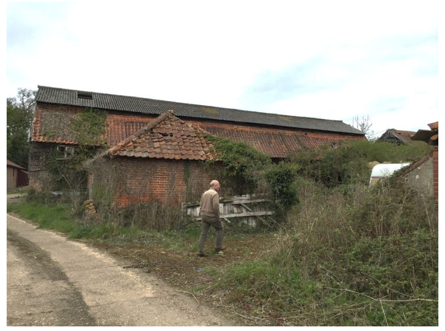
Image depicting the lowered central asbestos section of roof to be raised and the easterly wing.

appreciate the structure. To alleviate this the proposal incorporates a glazed clerestory to the upper section of roof. Currently this area is thought to have been lowered and a new lightweight sawn timber structure with asbestos cladding installed sometime in the C20th. The proposal is to remove this poorly detailed addition and replace it with a glazed clerestory to the east and west, allowing the building to be punctuated by plenty of light whilst not affecting any of the historic fabric. The proposal is to then install a new zinc roof with standing seam construction. This will have similar detailing to historic leadwork, and will have an agricultural feel to it, providing a good replacement to the corrugated asbestos and plastic sheeting currently on the roof. The clerestory will be within the roofspace of the barn and so will not create any overlooking issues.