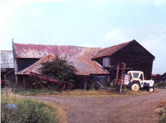
View of the easterly elements (from left to right, existing now and previously (taken from the heritage statement)) which have since collapsed, where remnants of these remain they will form new external garden wall features in order to convey the historical narrative of the site.