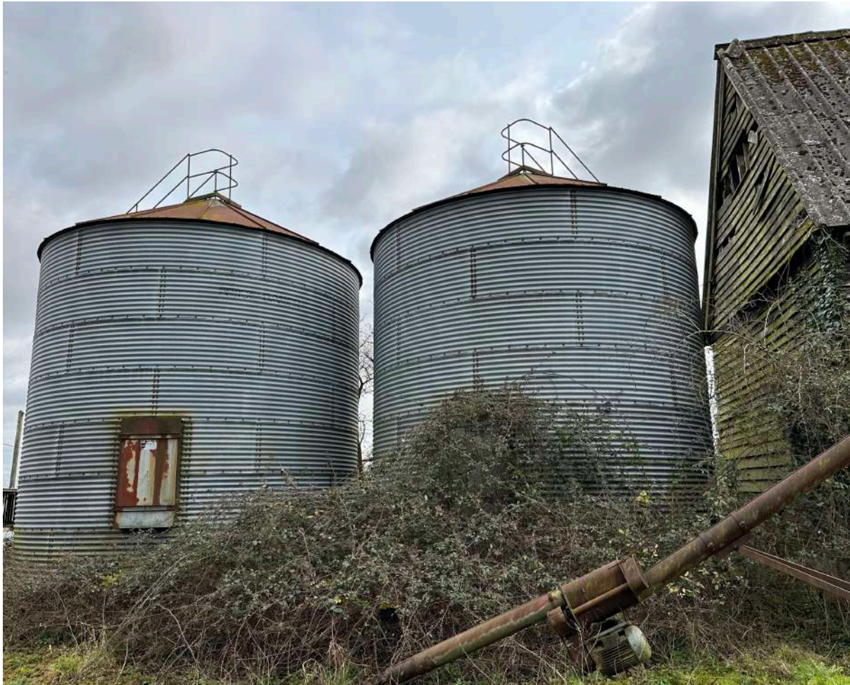
Steel Tower Grain Silos with 'Grain Store Building to the left

respect the original building fabric and alterations where necessary would be minimal in nature and looks to reuse and retain in place as much historic fabric and possible to maintain the character of the original farmstead.