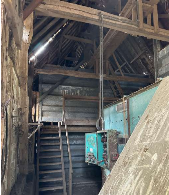
Grain Barn - Substantial well preserved Timber frame

The Grain Barn - The Grain barn has a substantial Oak frame which looks to be largely in good condition on both walls and roof although this is limited to inspection due to the large, galvanised steel grain silos within the building. Where accessible the barn appears to be an early 17th century frame of an excellent quality and again the linked wings on the Eastern sides have caused localised damage when they have also collapsed.