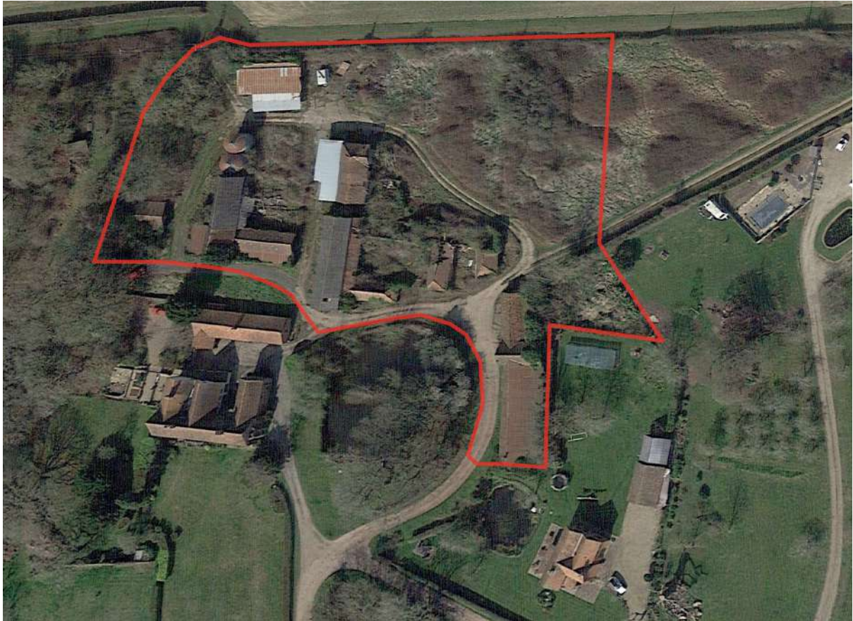
GOOGLE EARTH VIEW