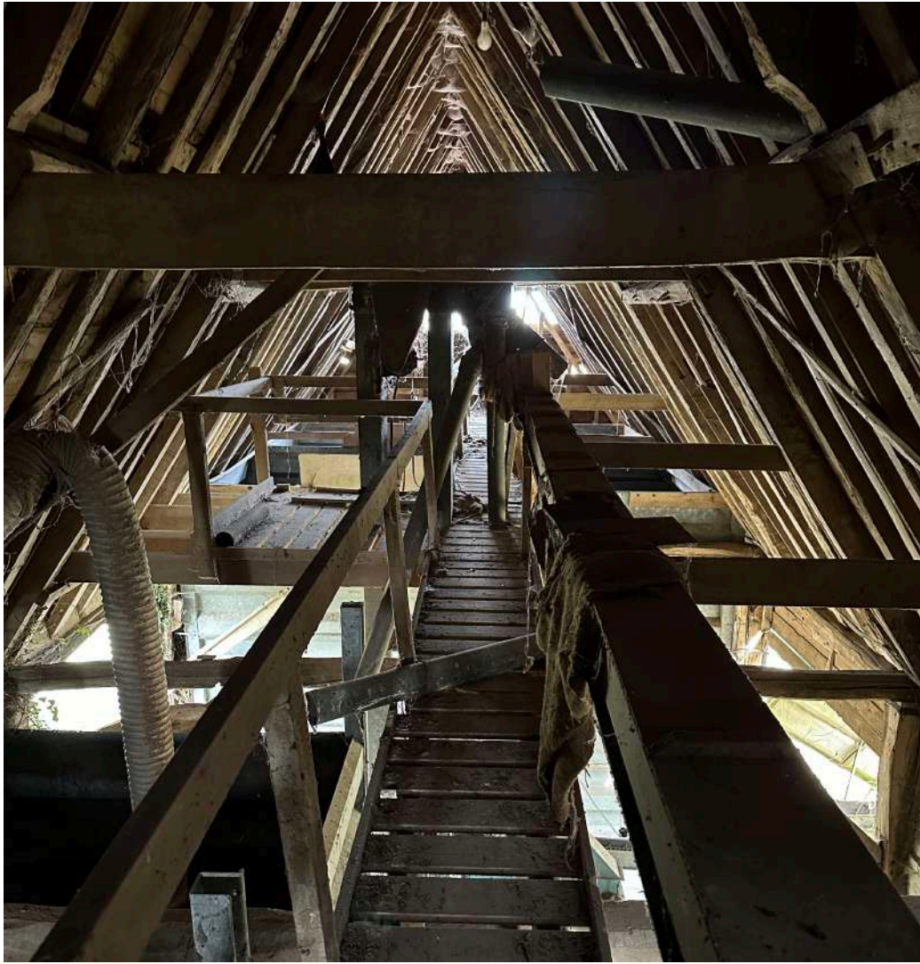
Grain Barn -Main roof high level walk-way