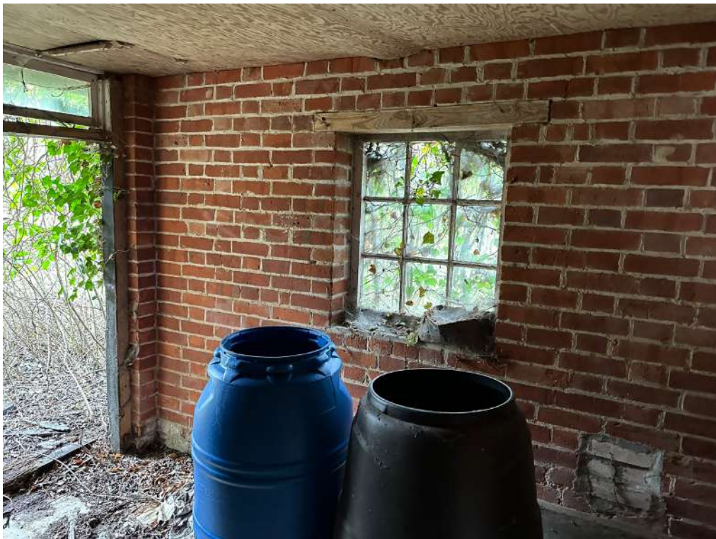
Brick walls of the Long 'Pig Shed'

The Pig Shed - The Pig Shed is a simple single storey brick and block building with pitched tiled roof to the northern section and low-pitched steel sheet roof to the south over the blockwork and timber pig pens. Whilst the building is sound with some it capable of conversion it is, in the current scheme intended to demolish the building.