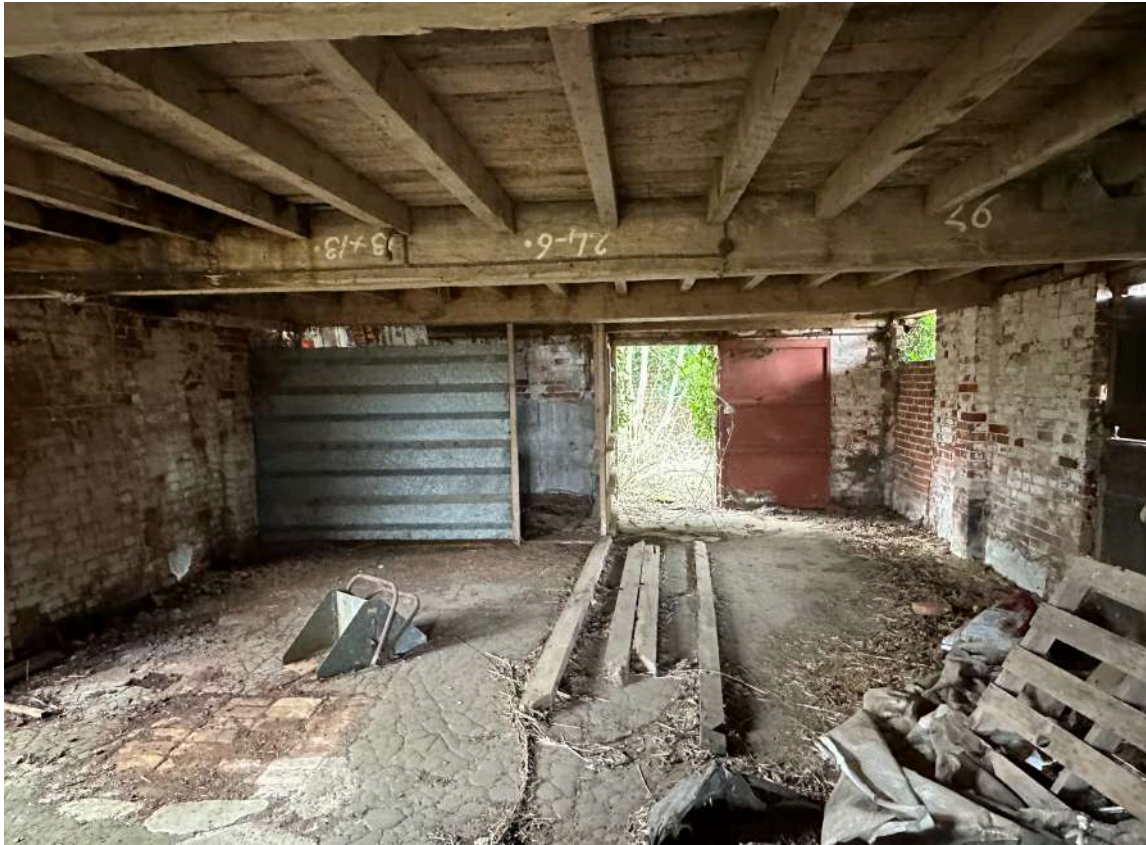
The 'Old Mill' Building with Brick Ground floor walls (Above) and timber frame with Brick infill to the first floor (below)