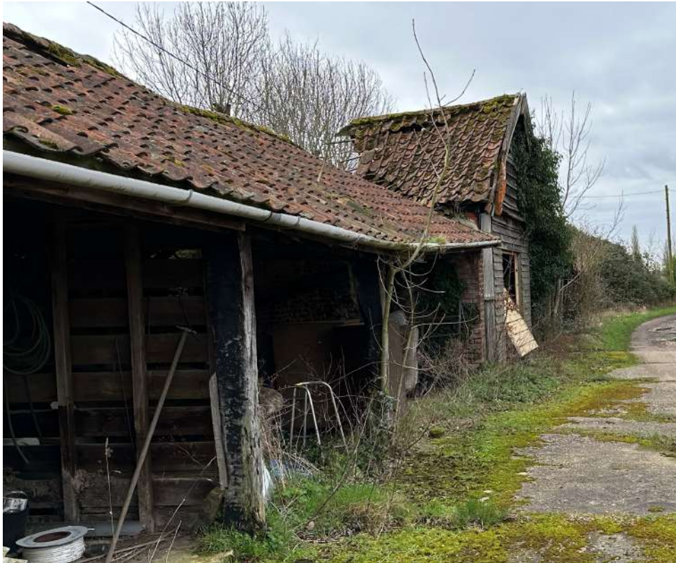
Cartlodge - Showing the garage section roof now partially collapsed (above) and Clay lump wall still intact (Below)

The Cartlodge - The Cartlodge Building is a combination of brick and timber frame, consisting of several elements which are largely intact however the central 'garage' section has deteriorated and its roof has now collapsed since the last survey. The associated side walls of brick, flint and clay lump have remained in place but would again need some repairs prior to their conversion.