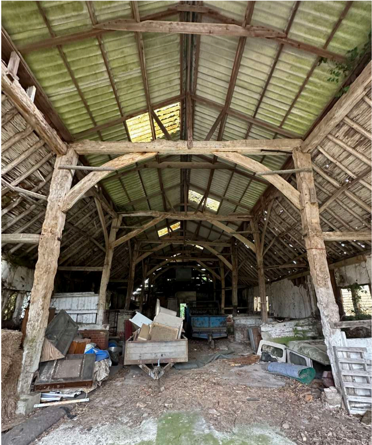
Open Barn - Showing Aisled Oak frame and replacement roof