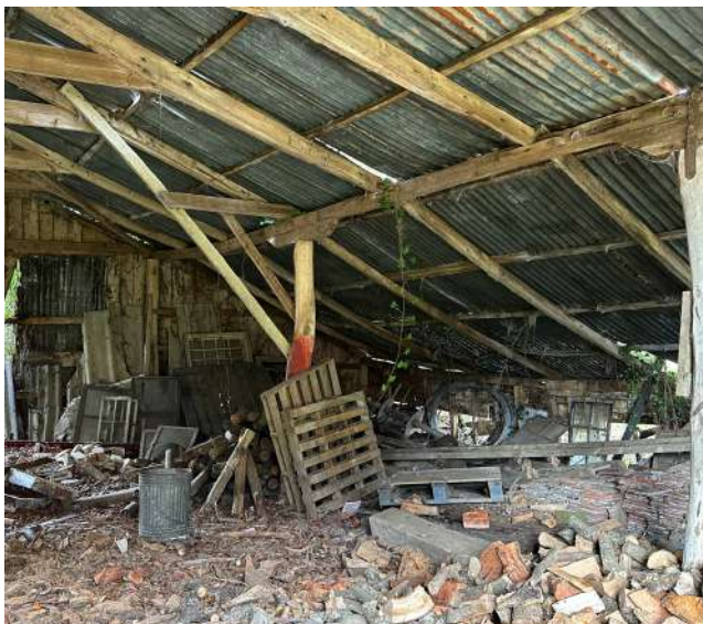
Timber framed 'Woodshed'

The Woodshed - The woodshed is a simple softwood post framed building with low pitched sheet roof finish, although still in use the building has not been included as part of the conversion proposals and is due to be demolished in the overall scheme.