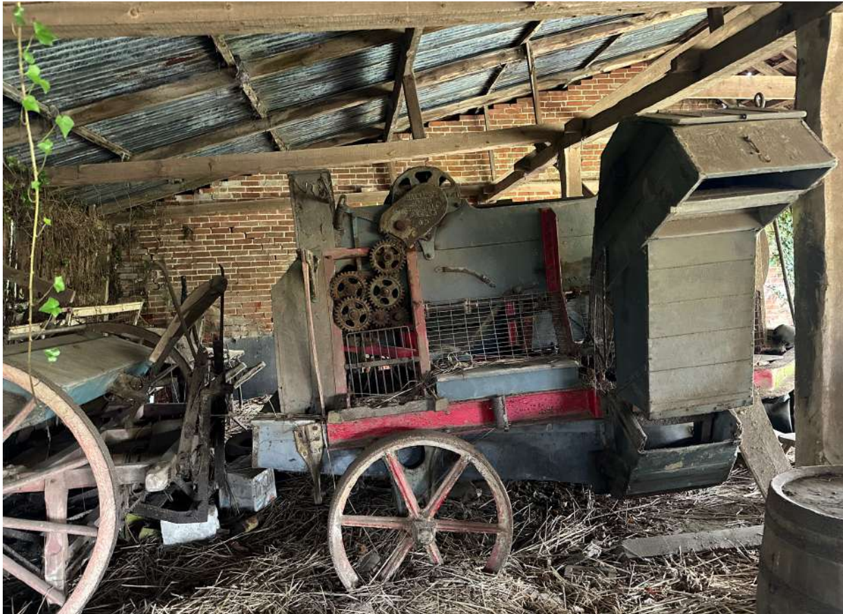
Cartlodge - Showing Southern end brick gable wall and Threshing machine storage

The Woodshed - The woodshed is a simple softwood post framed building with low pitched sheet roof finish, although still in use the building has not been included as part of the conversion proposals and is due to be demolished in the overall scheme.