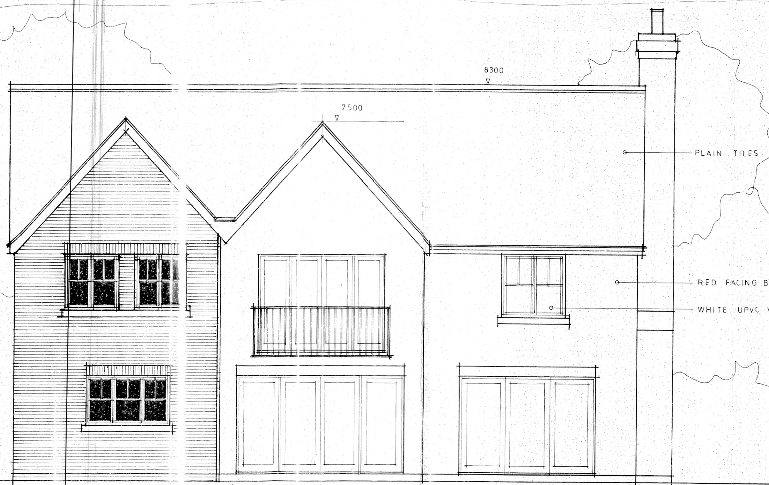
( NORTH ) REAR