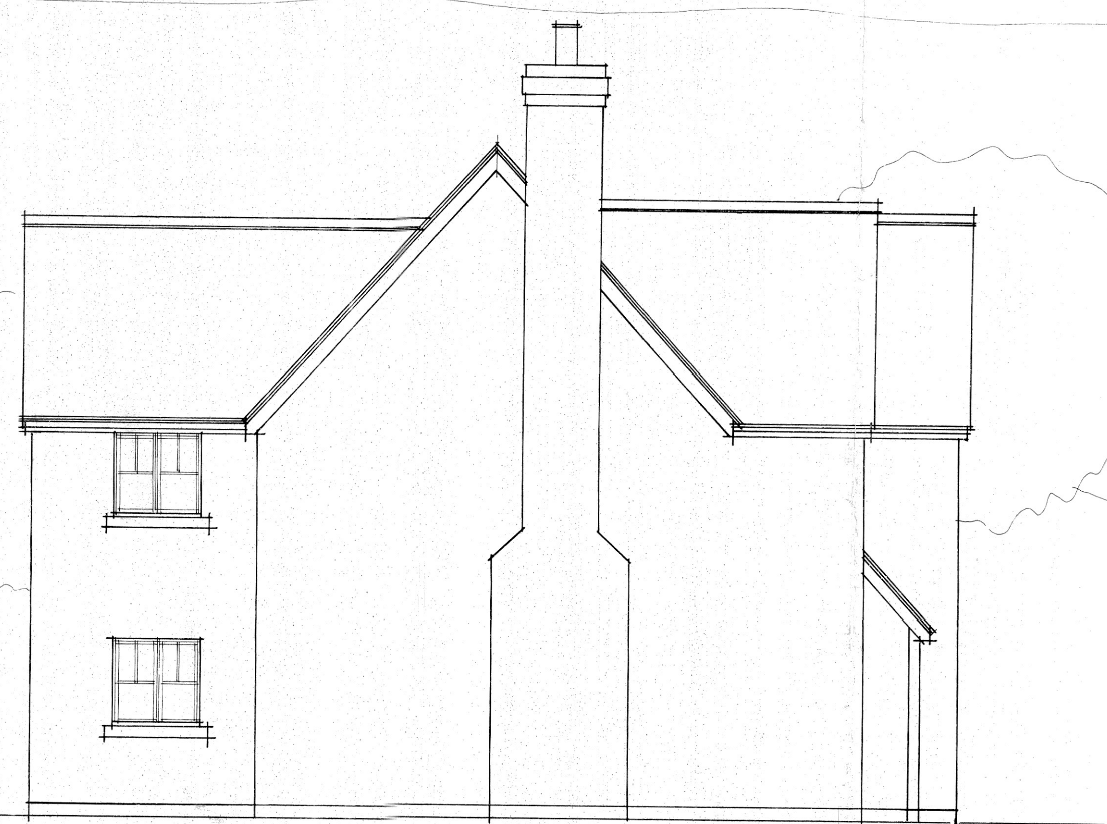
( WEST ) SIDE