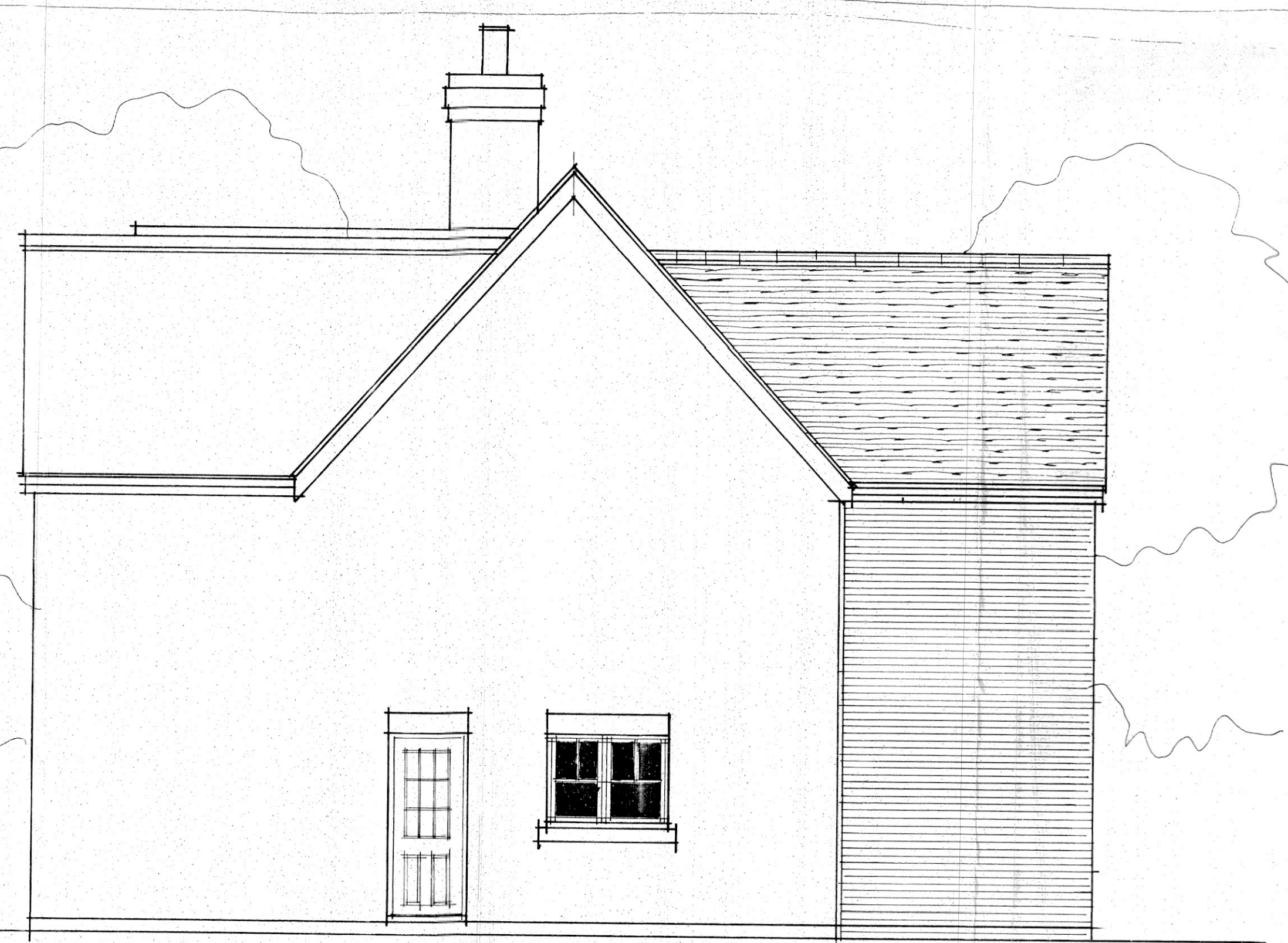
( EAST ) SIDE