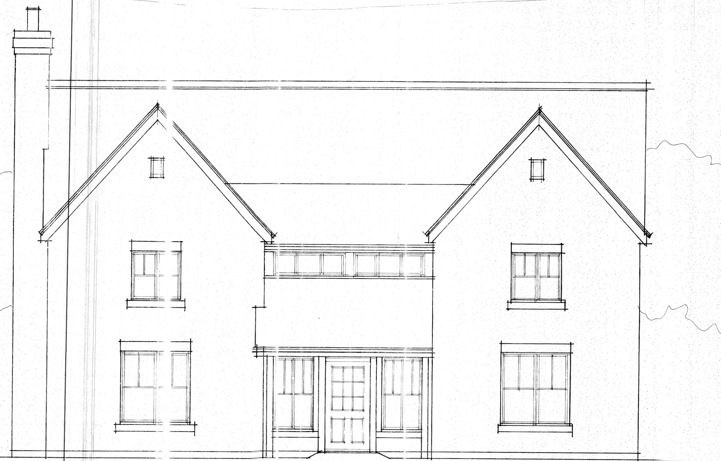
( SOUTH ) FRONT