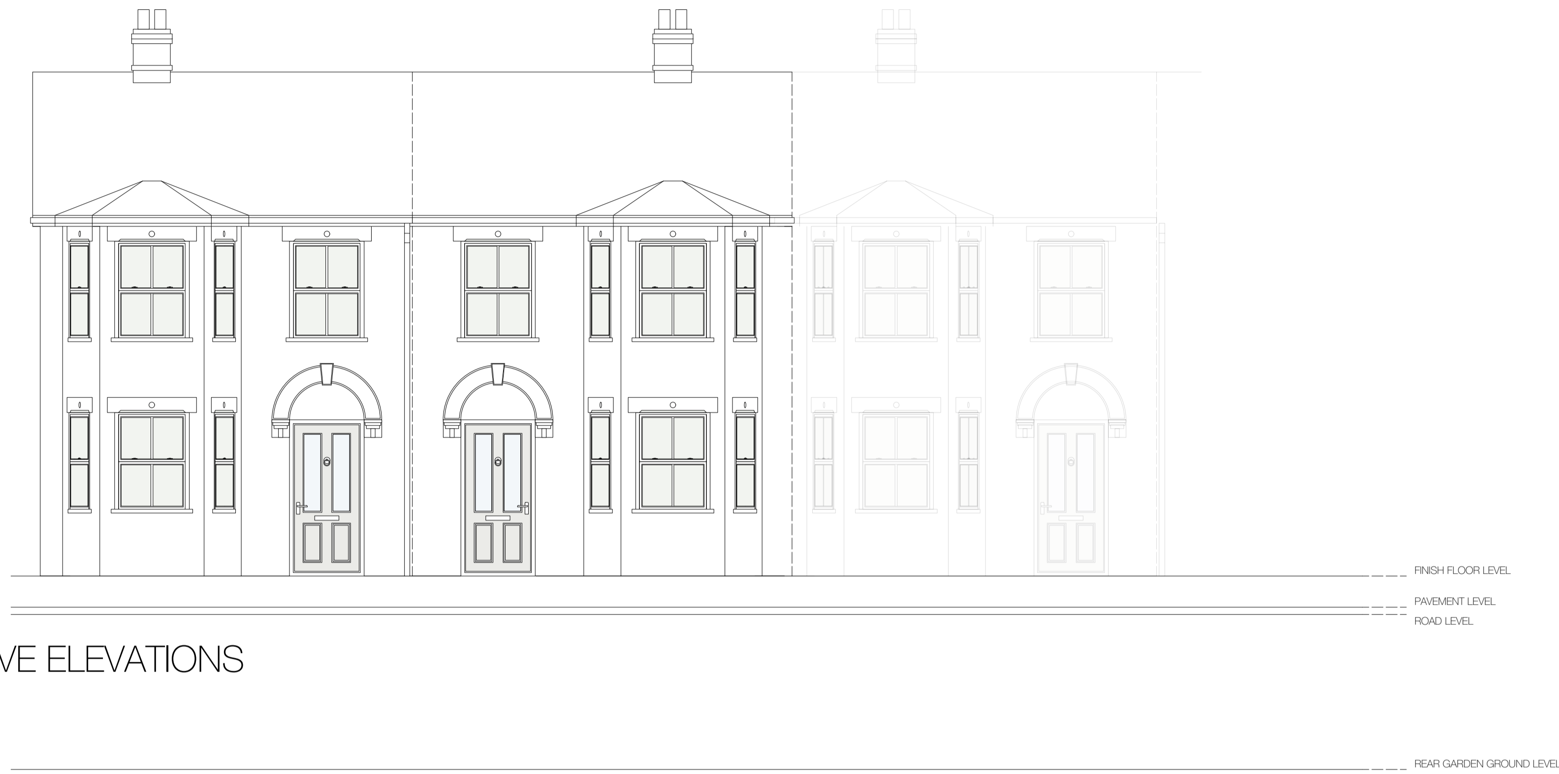
INDICATIVE ELEVATIONS SCALE 1:50