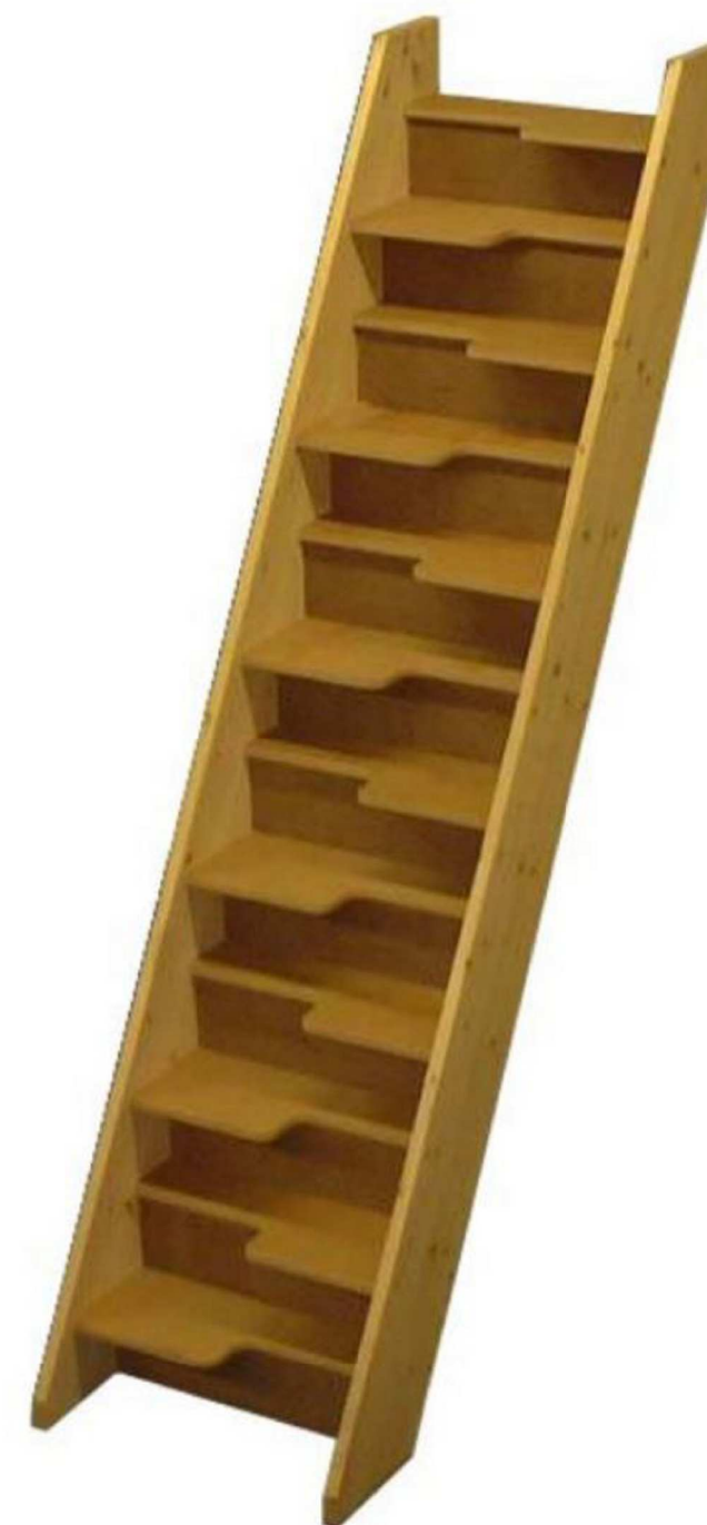
Alternating tread staircase to Flood Refuge Area