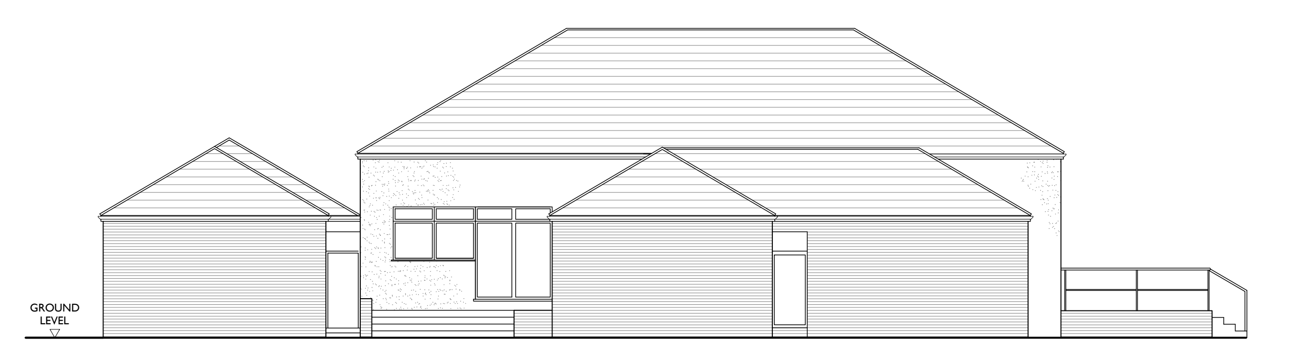
SIDE (EAST) ELEVATION AS EXISTING