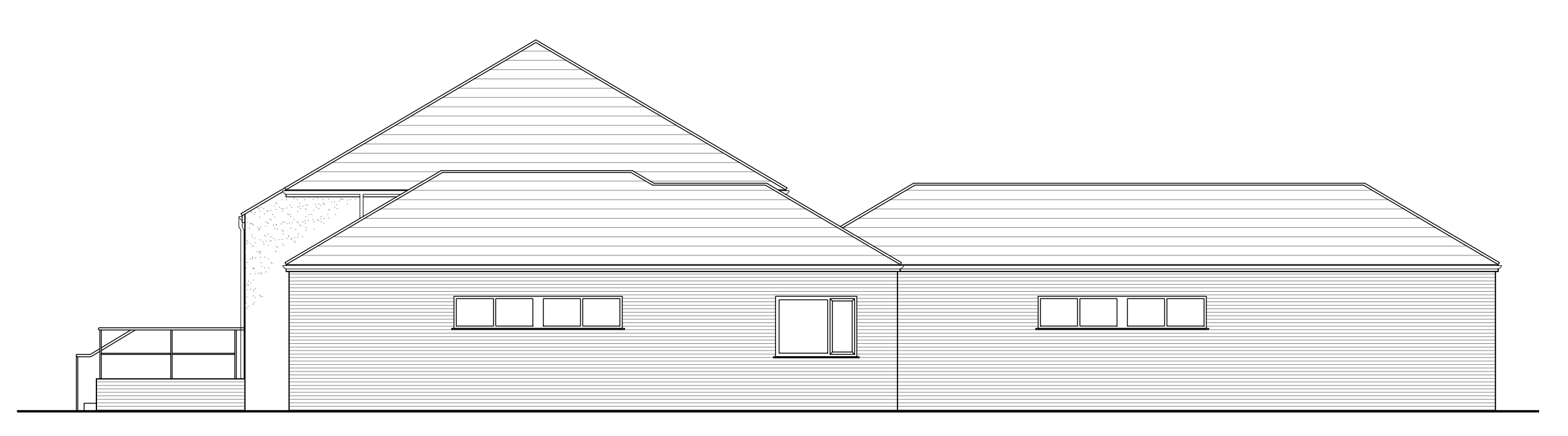
FRONT (SOUTH) ELEVATION AS EXISTING