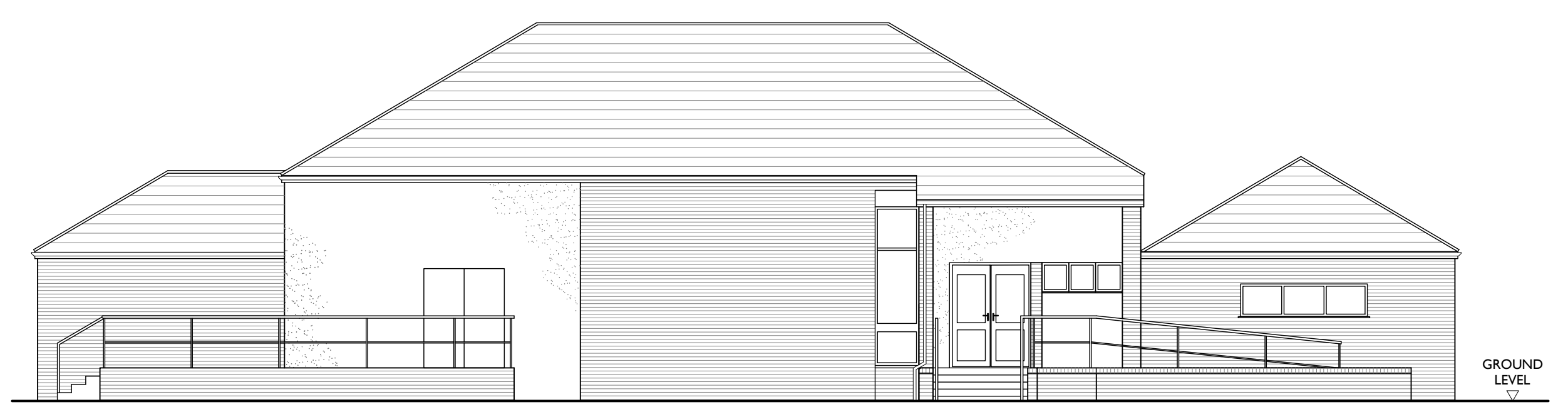
SIDE (WEST) ELEVATION AS PROPOSED