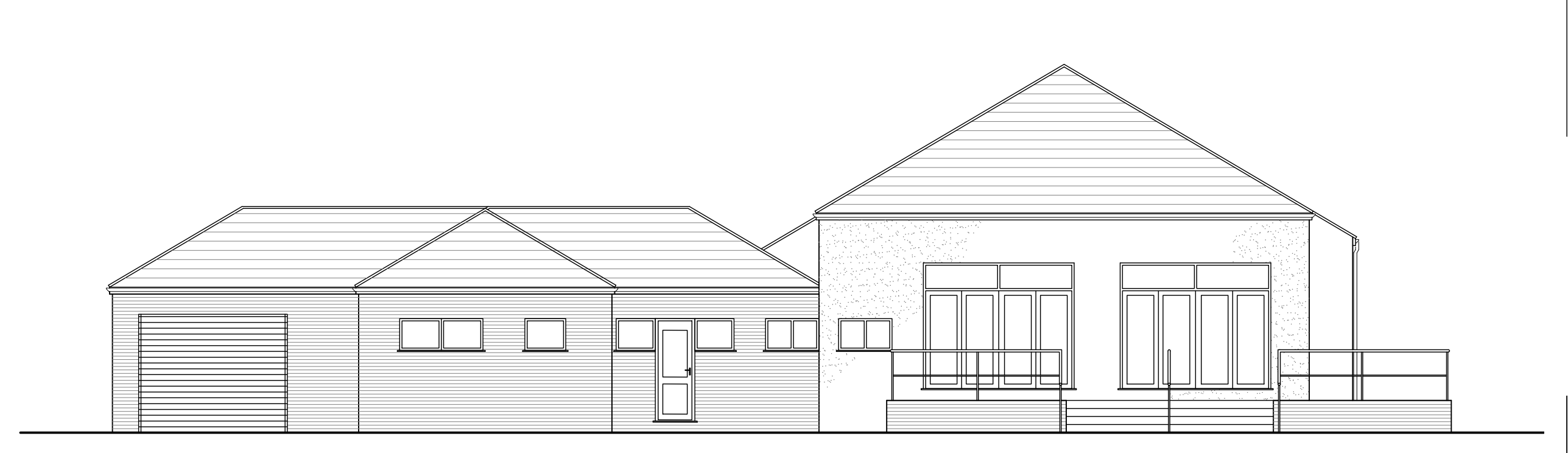
REAR (NORTH) ELEVATION AS PROPOSED