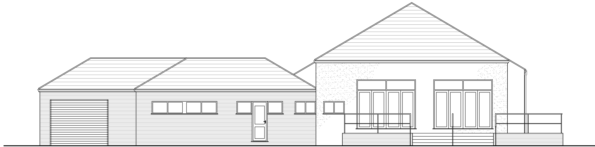
REAR (NORTH) ELEVATION AS EXISTING

© RAM architecture. Copyright is reserved by RAM architecture and the drawing is issued on the condition that it is not copied, reproduced, retained, or disclosed to any unauthorised person, either wholly or in part, without the consent in writing of RAM architecture. All work to be carried out in accordance with current Building Regulations. Any discrepancies must be reported to the Architect. If in doubt, ask.