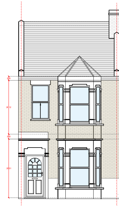
(A) EXISTING ELEVATION A