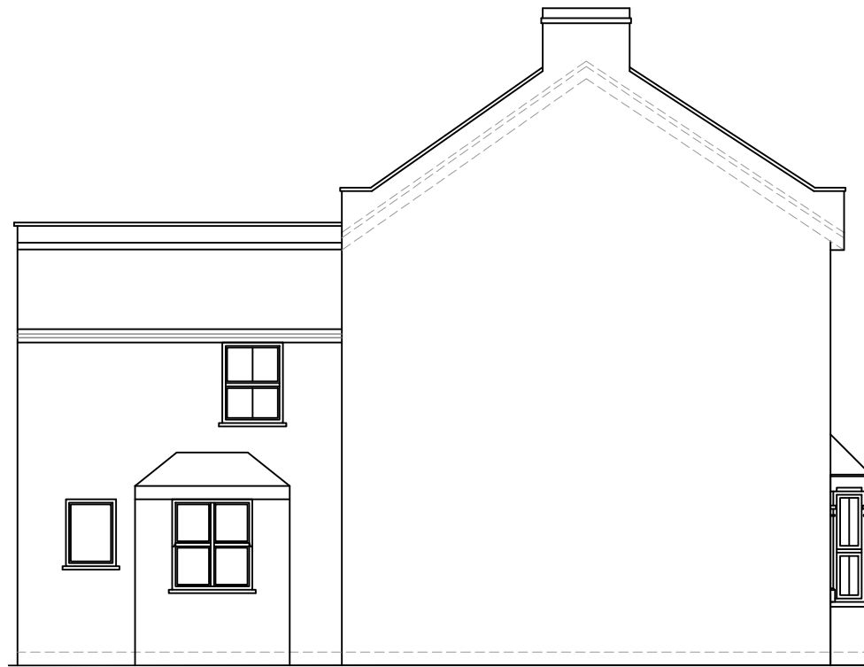
EXISTING ELEVATION SIDE B SCALE 1:100