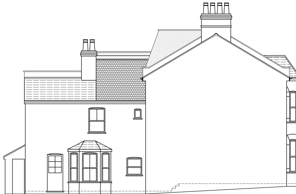
SIDE ELEVATION (EXISTING) SCALE 1:100