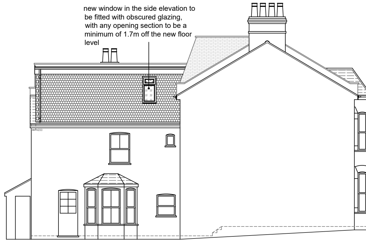
SIDE ELEVATION (PROPOSED) SCALE 1:100