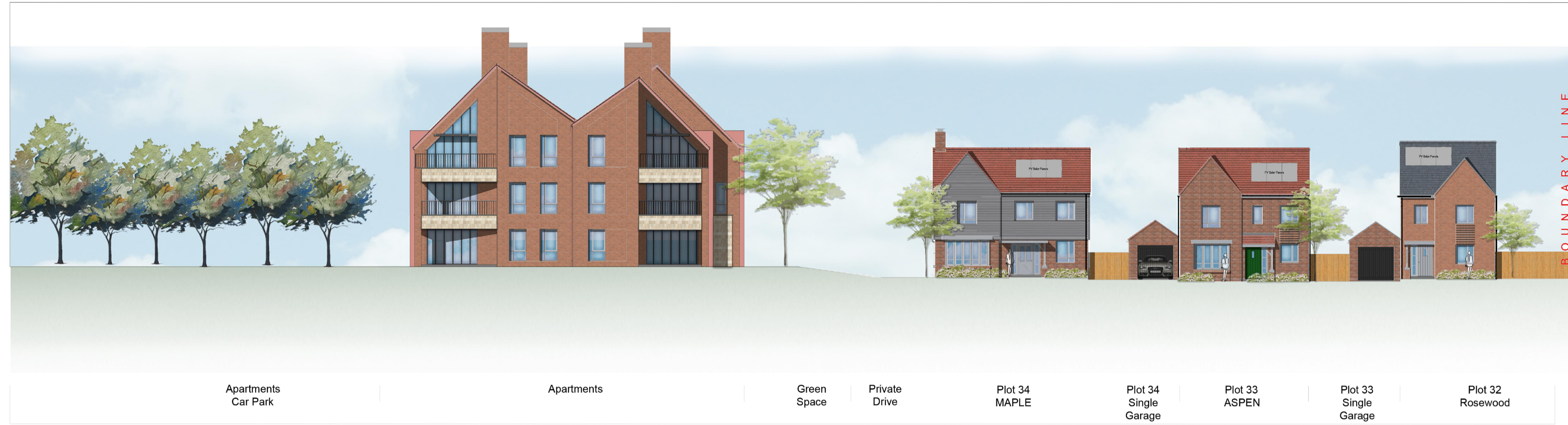
Street Scene C-C