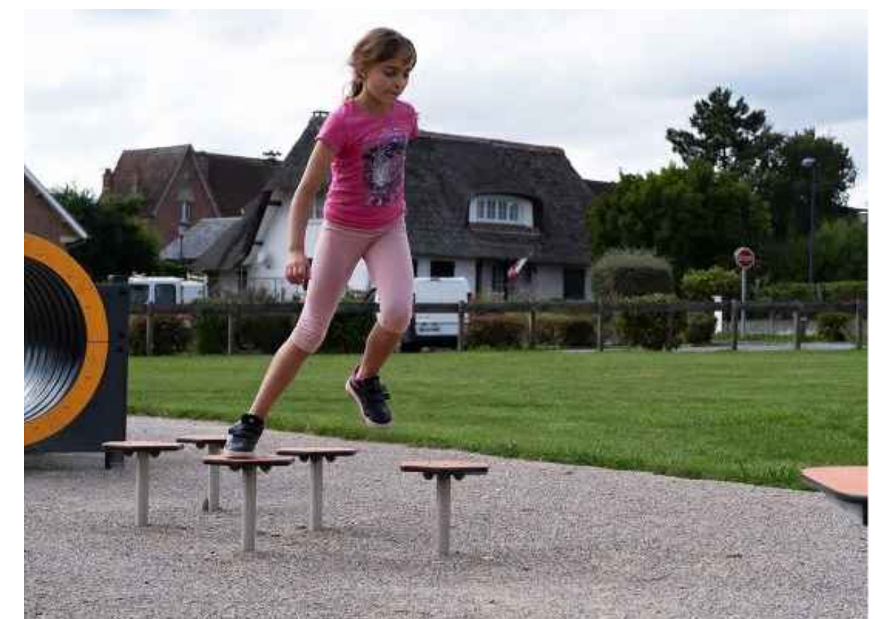
4. Product: Steps Supplier: Proludic Size: 1.95mW, 0.70mD, 0.27mH. Weight: 31kg Product Code: J5903

NOTE: Planting plan detail see Aspect drawing 8123.PP.1.0