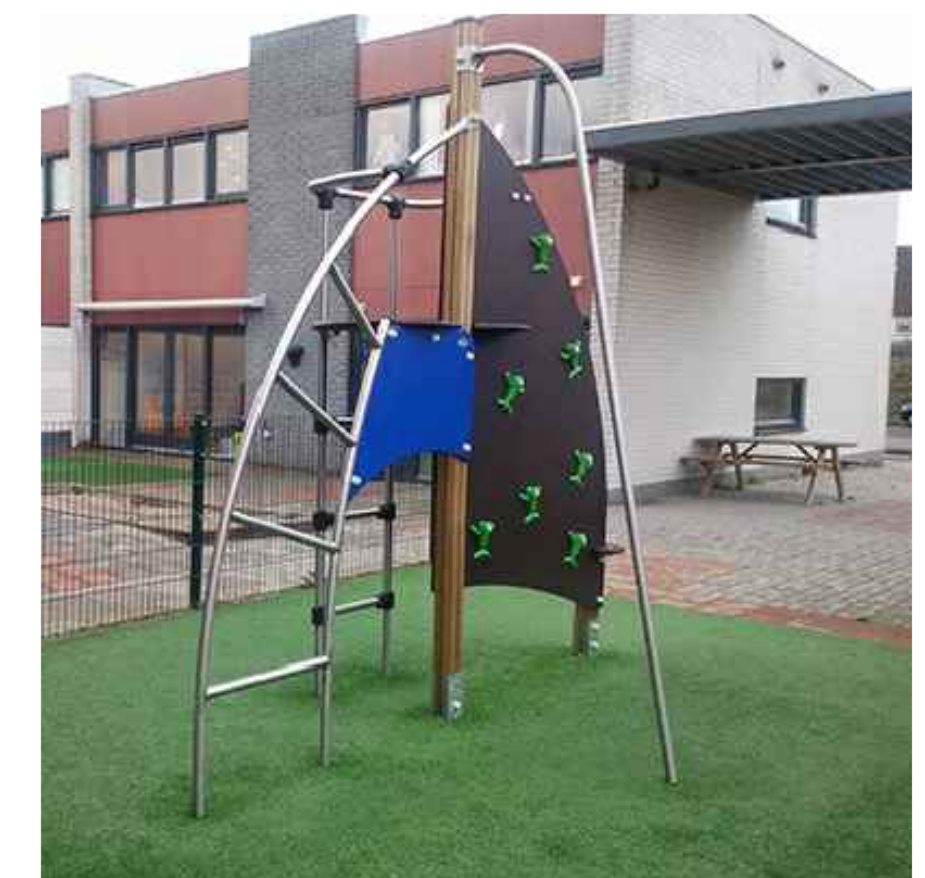
2. Product: Climbing equipment Supplier: Proludic Size: 1.68mW, 3.09m.D, 3.00m.H. Weight: 142.3kg Product Code: J410