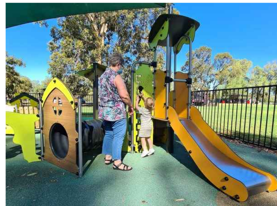
1. Product: Playhouse Supplier: Proludic Size: 3.39mW, 2.77m.D, 2.12m.H. Weight: 200.25kg Product Code: J38706