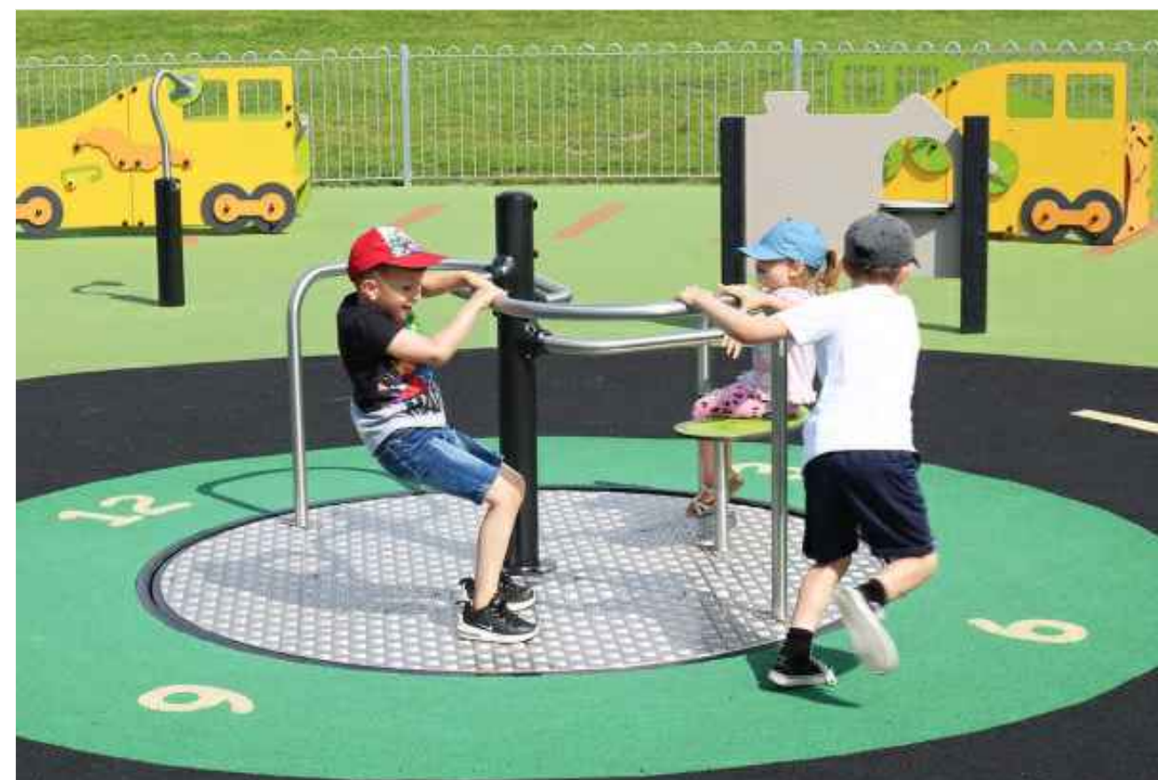
3. Product: Roundabout Supplier: Proludic Size: 2.10mW, 2.10mD, 1.0mH. Weight: 304kg Product Code: J2409