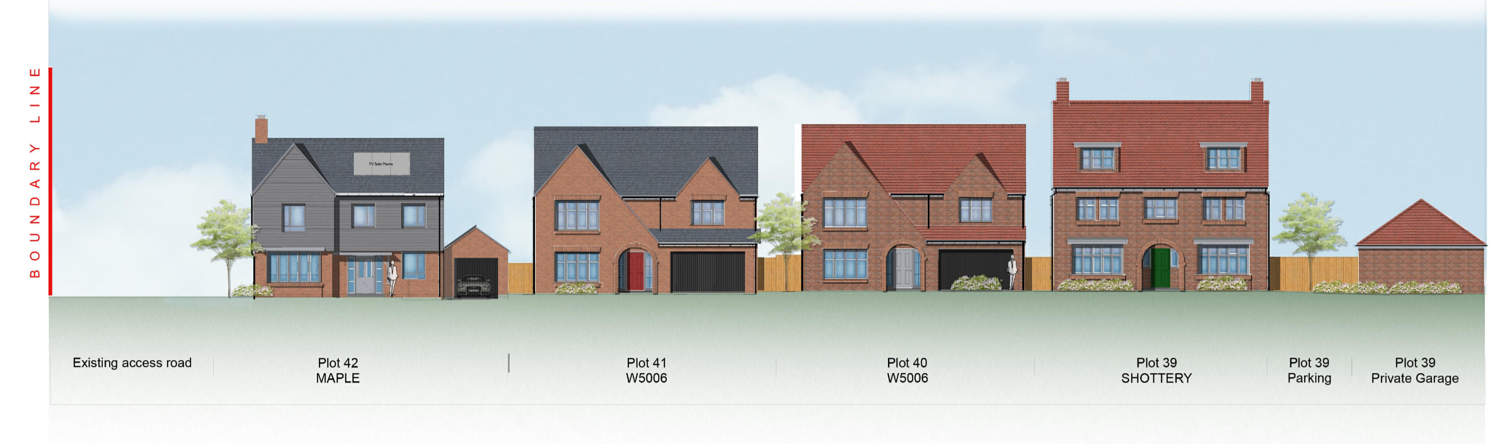
Street Scene A-A