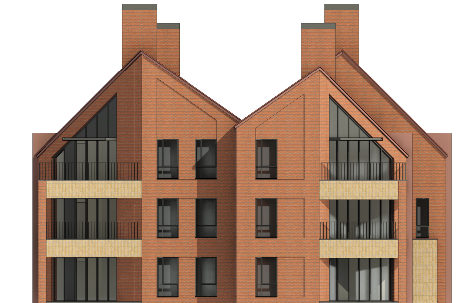
Right Elevation 1 : 100