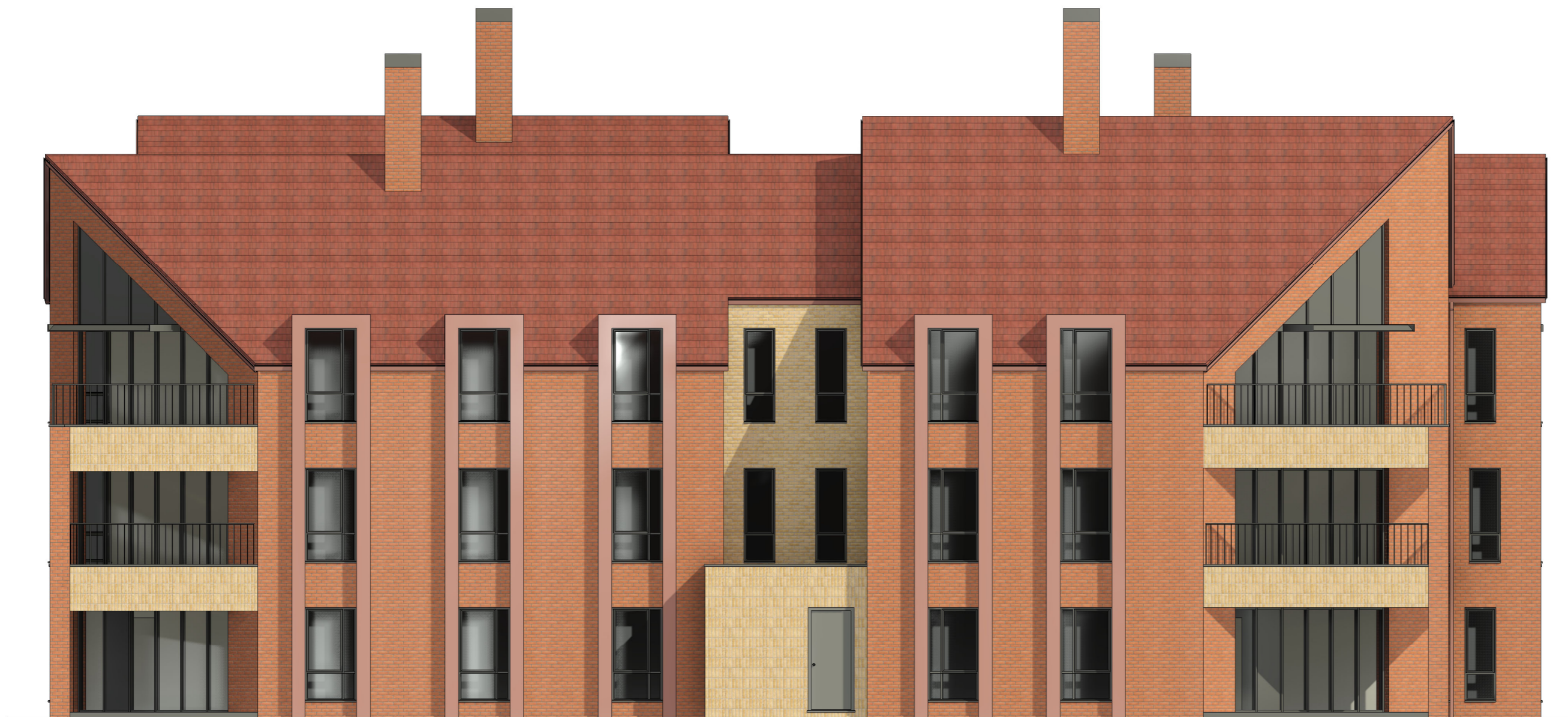
Front Elevation 1 : 100

BIM Transmittal Disclaimer McBains Ltd makes no express or implied warranties with respect to the character, function, or capabilities of the data (inclusive of 3rd party data incorporated within), or the suitability of the data for any particular purpose beyond those originally intended by McBains Ltd. Please refer to our standard terms and conditions for further details.