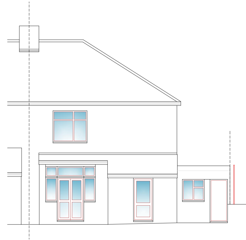
EXISTING REAR ELEVATION 1:100 @ A3

FIRST CEILING FIRST FLOOR GROUND CEILING GROUND FLOOR