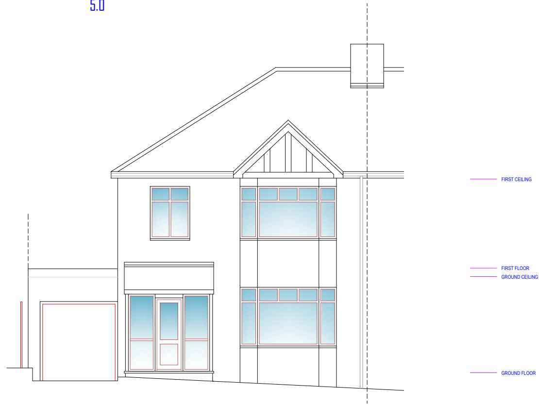
EXISTING FRONT ELEVATION 1:100 @ A3