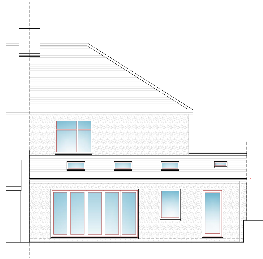
PROPOSED REAR ELEVATION 1:100 @ A3

IF IN DOUBT - ASK COPYRIGHT CITYSCAPE ARCHITECTURE LTD ALL DIMENSIONS, LEVELS AND ANGLES TO BE CHECKED ON SITE BY CONTRACTOR ALL BOUNDARIES ARE ASSUMED AND WE ACCEPT NO LIABILITY FOR BOUNDARY INACCURACY YOU ARE REMINDED OF YOUR RESPONSIBILITIES UNDER THE 'PARTY WALL ETC. ACT. 1996 WHERE APPLICABLE RESPONSIBILITY IS NOT ACCEPTED FOR ERRORS MADE BY OTHERS IN SCALING FROM THIS DRAWING ALL DRAIN RUNS EXISTING AND PROPOSED ARE TO BE VERIFIED ON SITE DUE TO RESTRICTED ACCESS - ENSURE ALL CONNECTIONS MADE TO CORRECT SYSTEMS