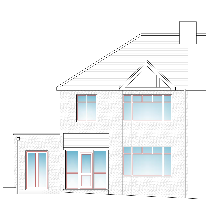
PROPOSED FRONT ELEVATION 1:100 @ A3

— FIRST CEILING — FIRST FLOOR — GROUND CEILING — GROUND FLOOR