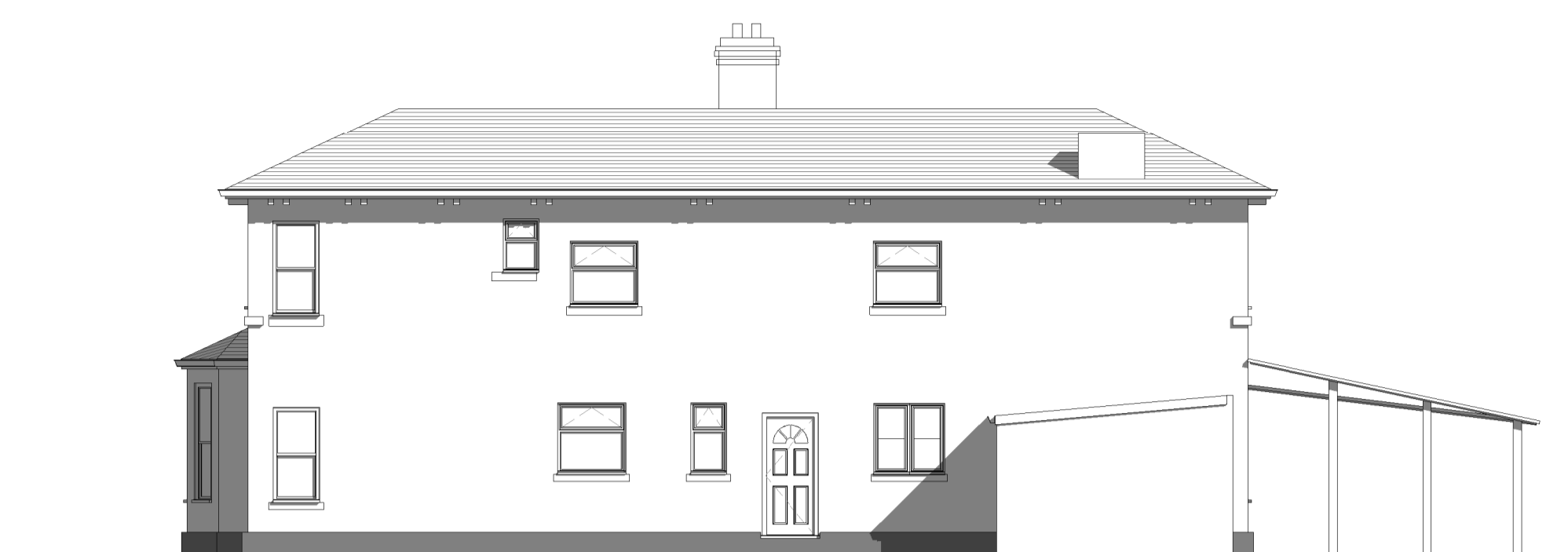
2 Rear Elevation to Car Park 1:100