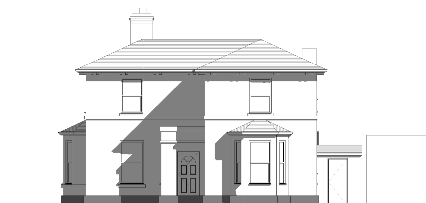
3 Side Elevation (Entrance) 1:100