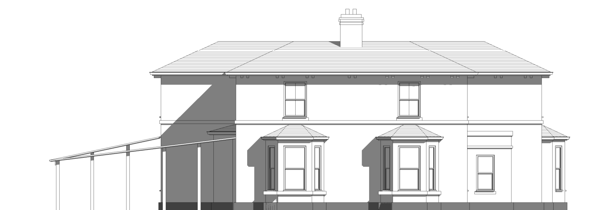
1 Front Elevation to Franche Road 1:100

It is assumed that all works on this drawing will be carried out by a competent contractor working, where appropriate, to an approved method statement.