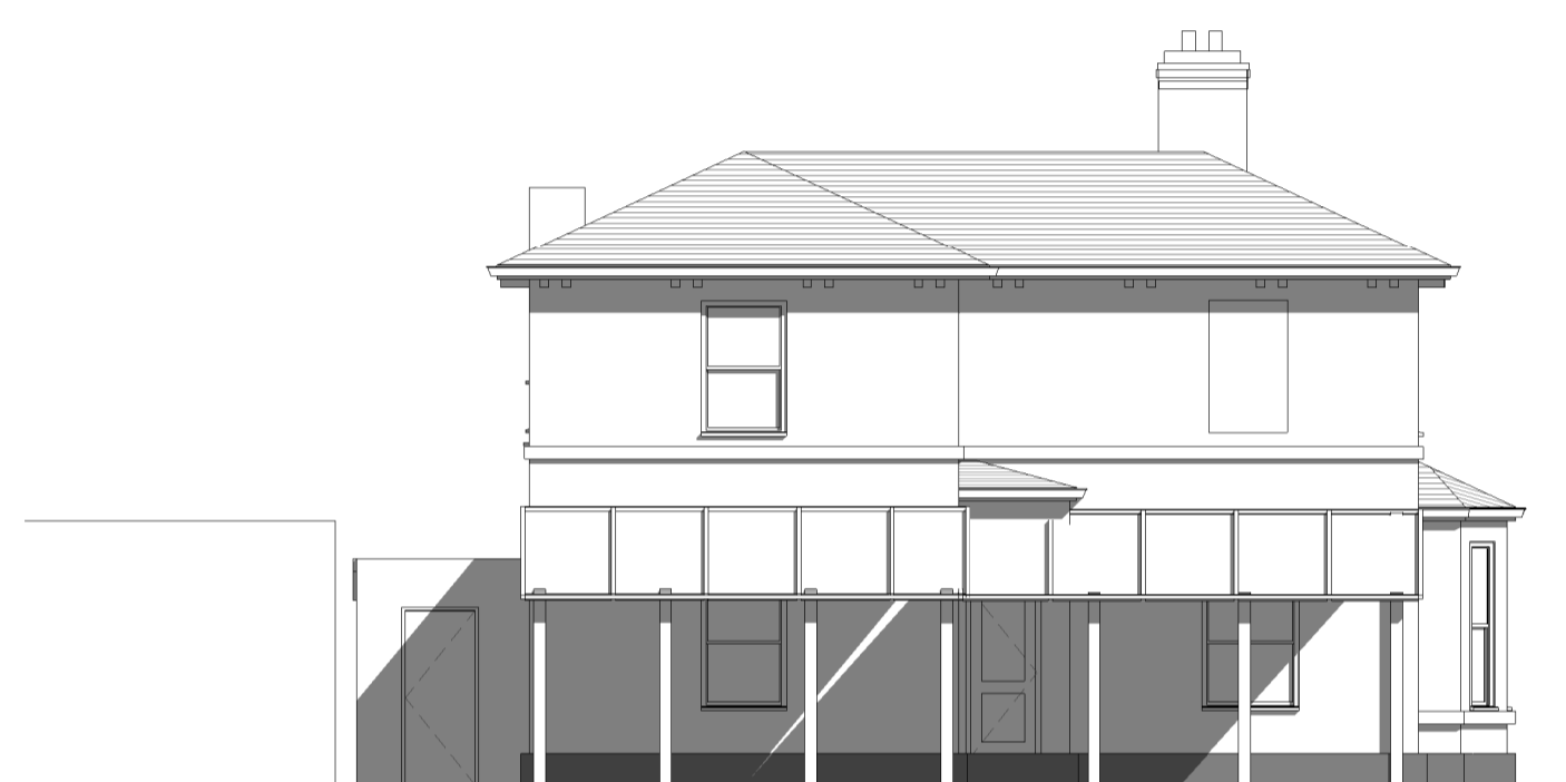
4 Side Elevation to Garden 1:100