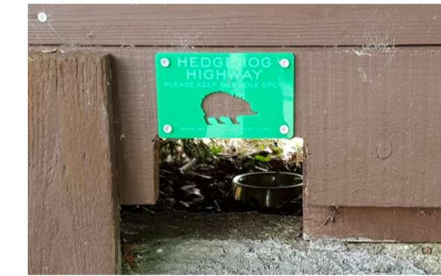
Hedgehog highway (1 per boundary fence)