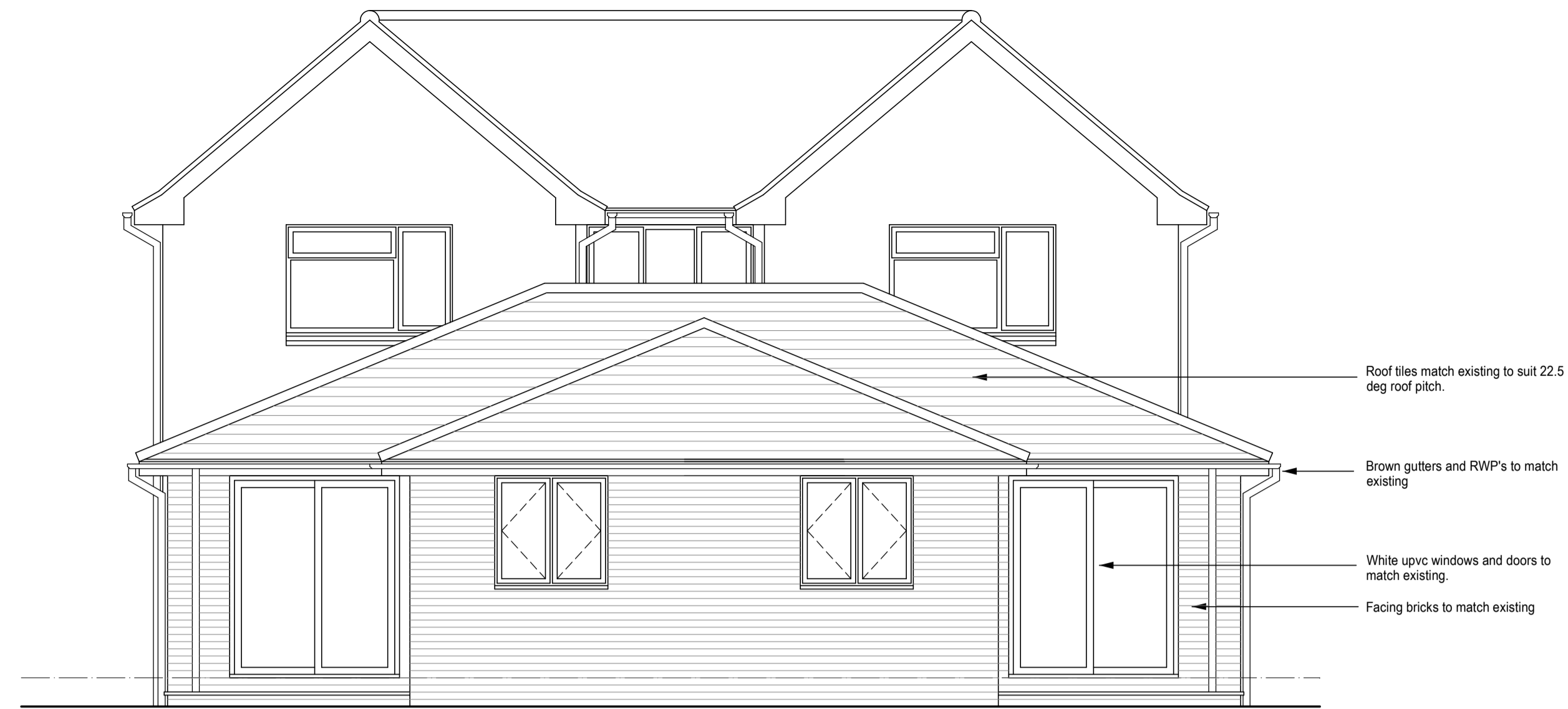
Rear Elevation (east)