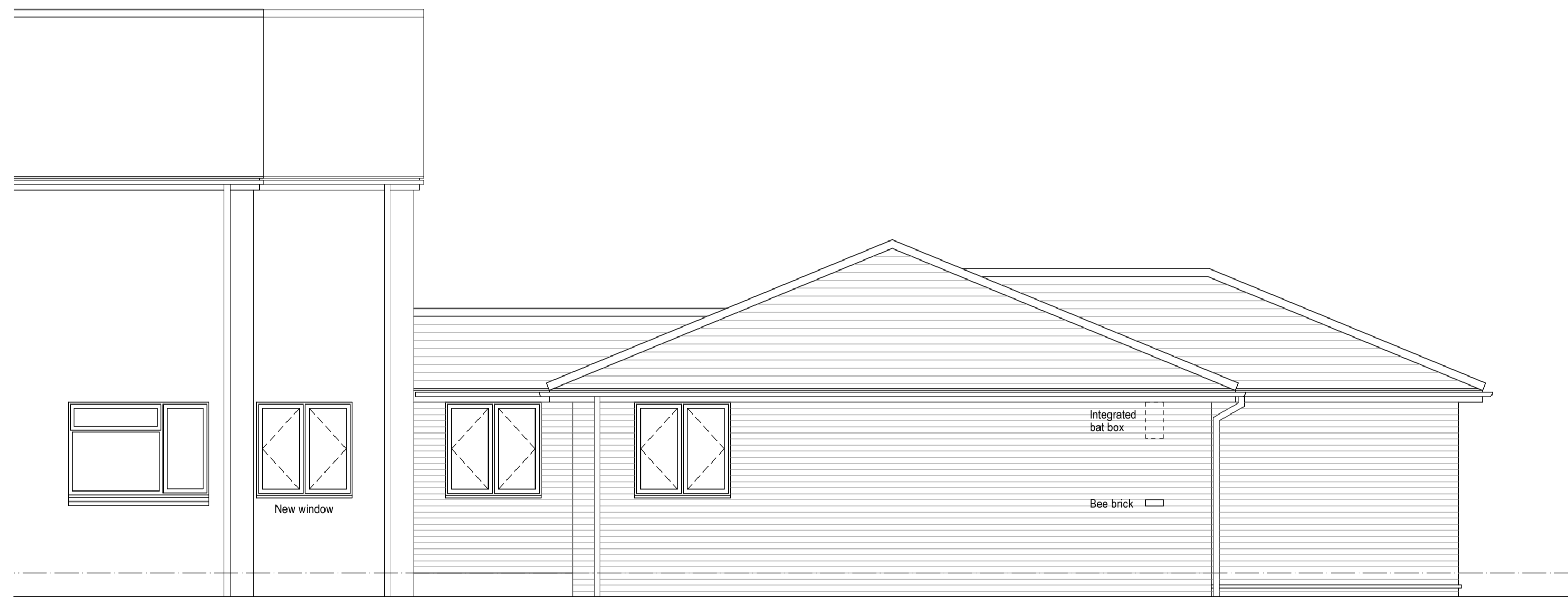
Side Elevation (south)