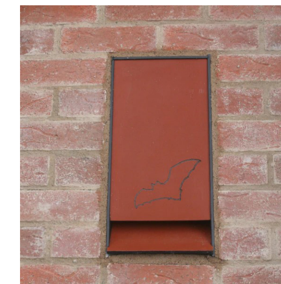
Integrated bat box