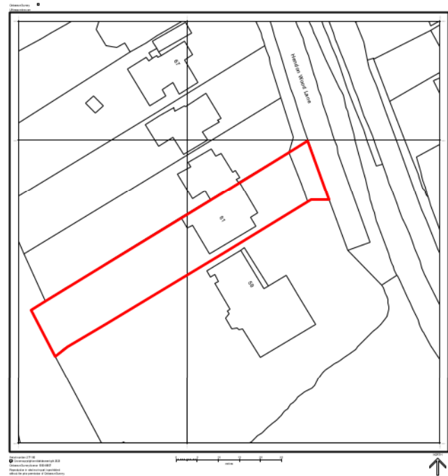
1:1250 Location Plan