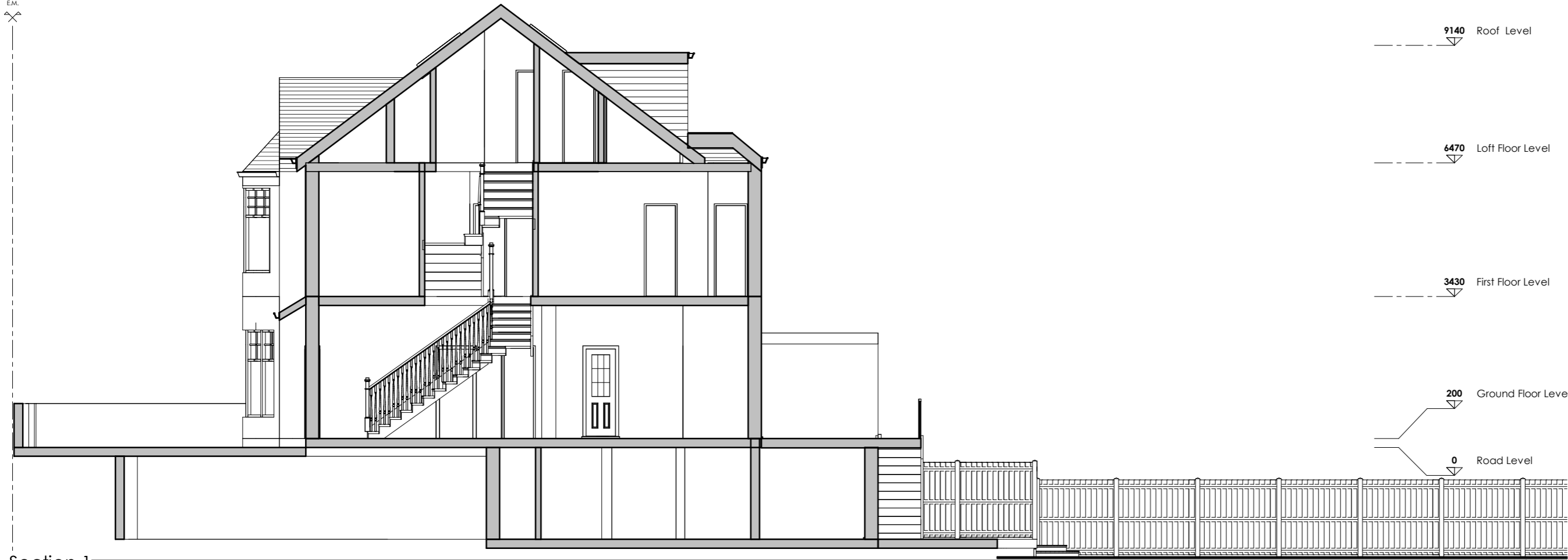
Section 1 1 : 100