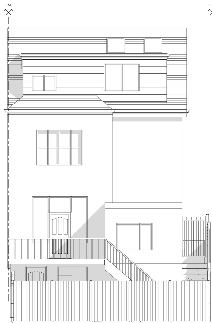
Rear Elevation 1 : 100

NOTES: Only Scale of drawings for the Planning Purposes. Report all discrepancies, errors and omissions. Verify all dimensions on site before commencing any work on site or preparing shop drawings. All materials, components and workmanship are to comply with the relevant British Standards, Codes of Practice, and appropriate manufacturers recommendations that from time to time shall apply. For all specialist work, see relevant drawings. This drawing and design are copyright of Planning Dimensions LTD