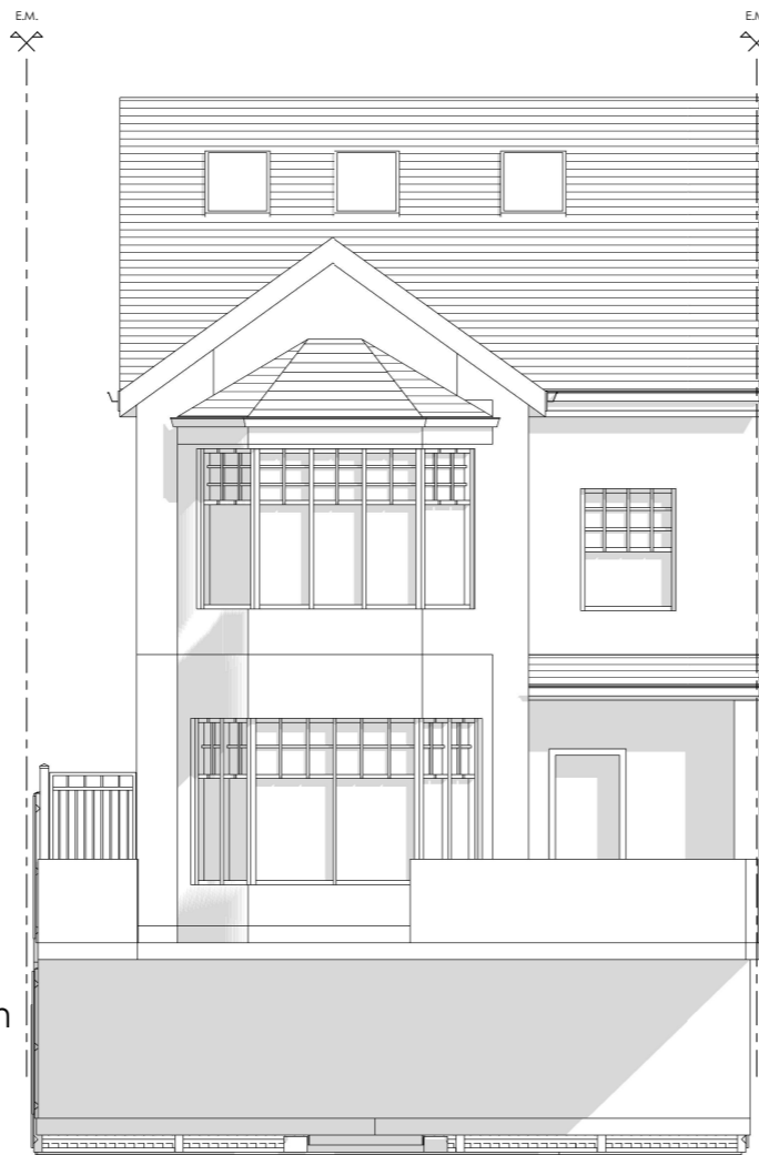
Front Elevation 1 : 100