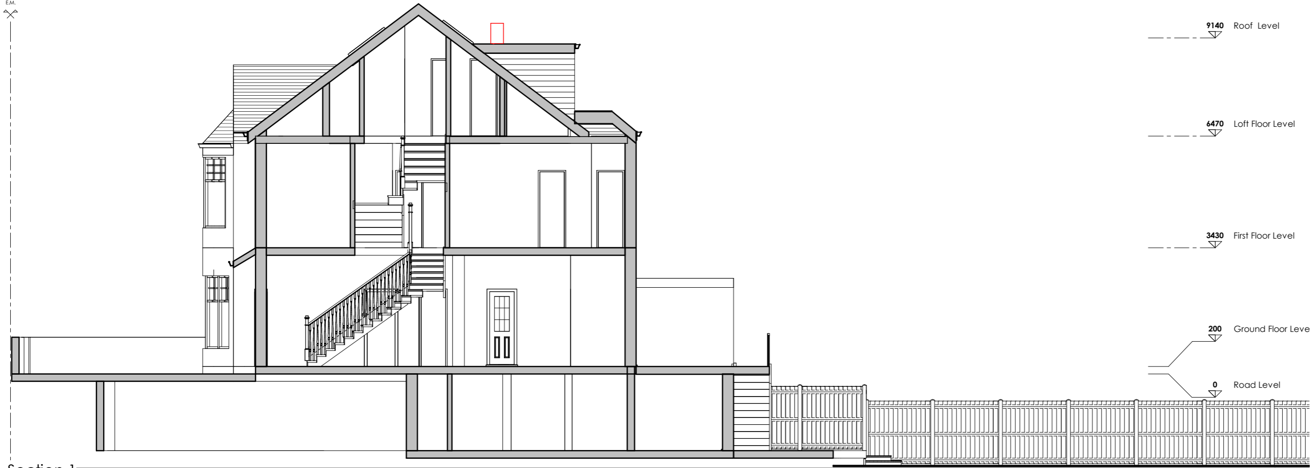
Section 1 1 : 100