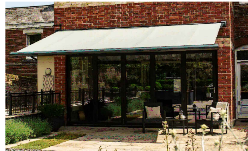
PHOTOS TO DEMONSTRATE EXAMPLE OF AWNING PROPOSED BOTH OUT AND RETRACTED