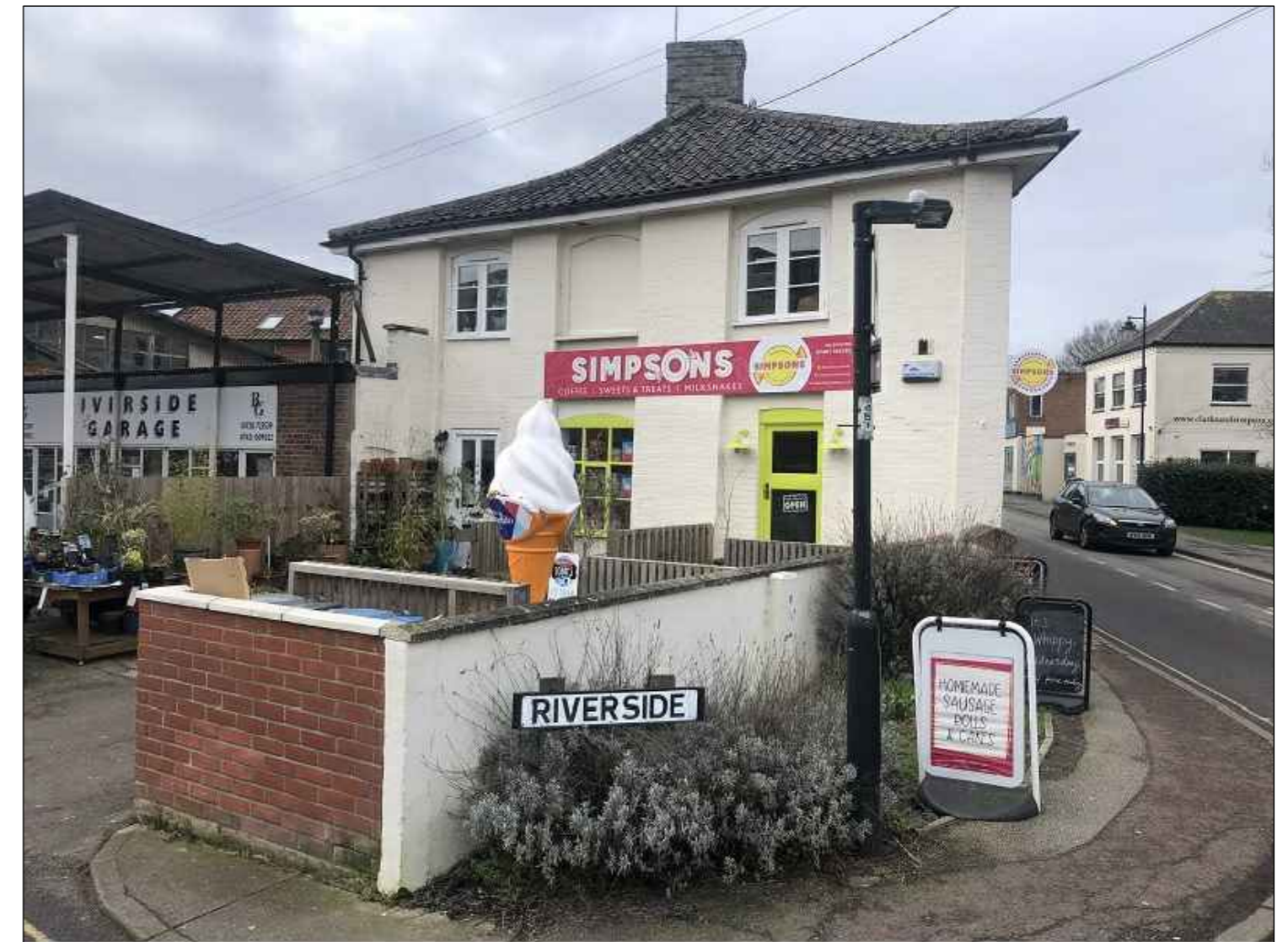
PHOTO FROM THE CORNER OF BRIDGE STREET AND RIVERSIDE