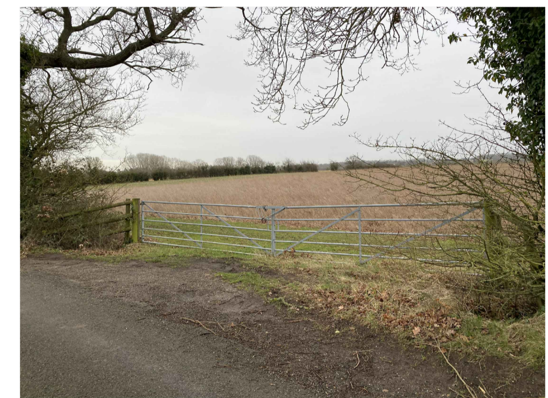
Existing gates & access