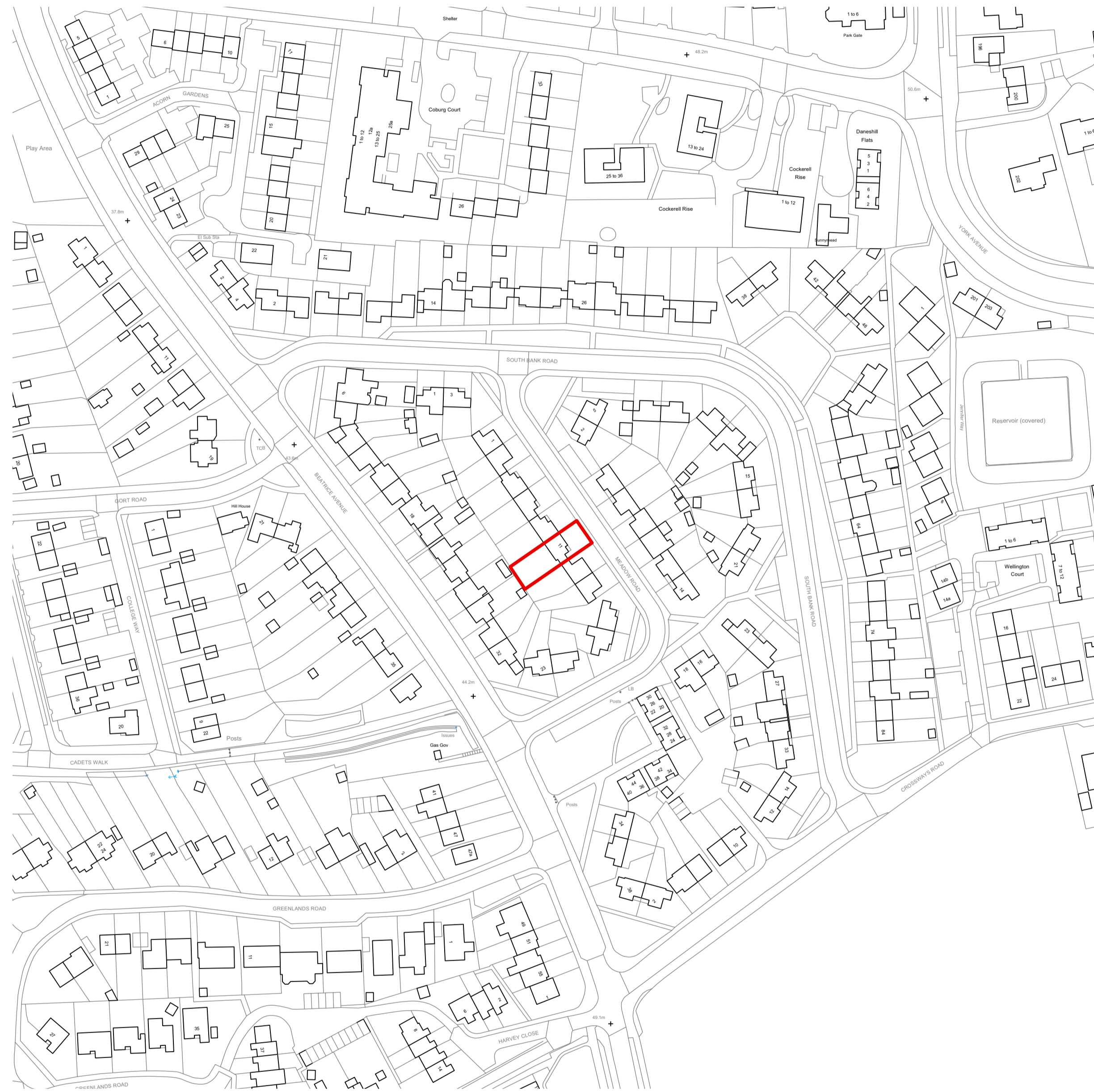
Location Plan @1:1250