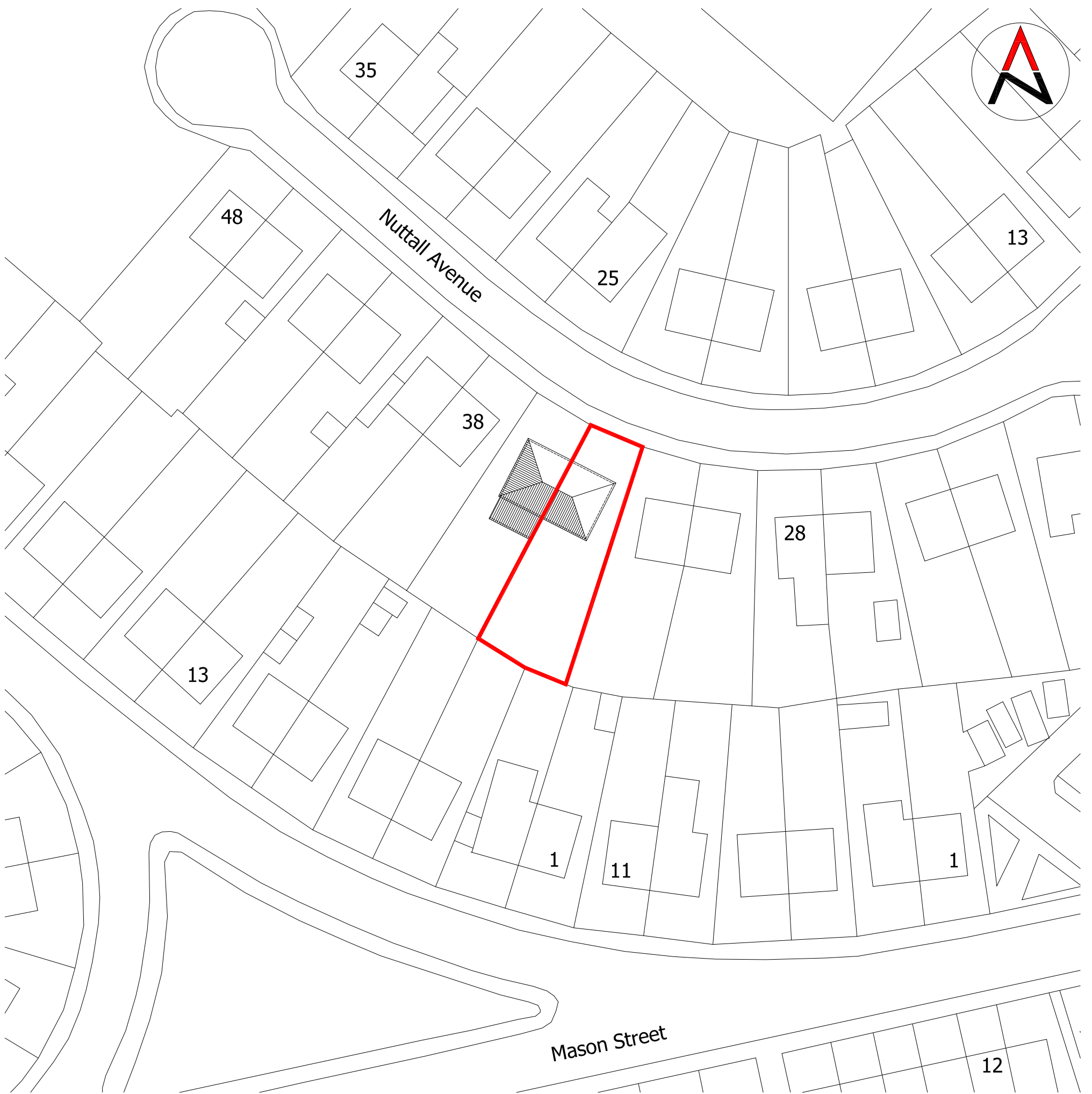
Site plan 1:500