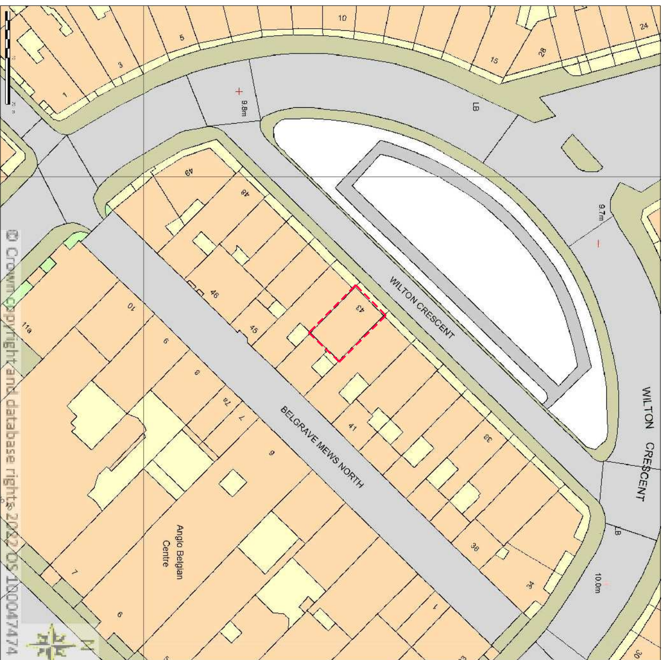
LOCATION OS MAP PLAN. 1:1,250