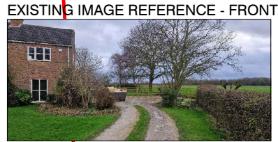
EXISTING IMAGE REFERENCE - FRONT OF PROPERTY