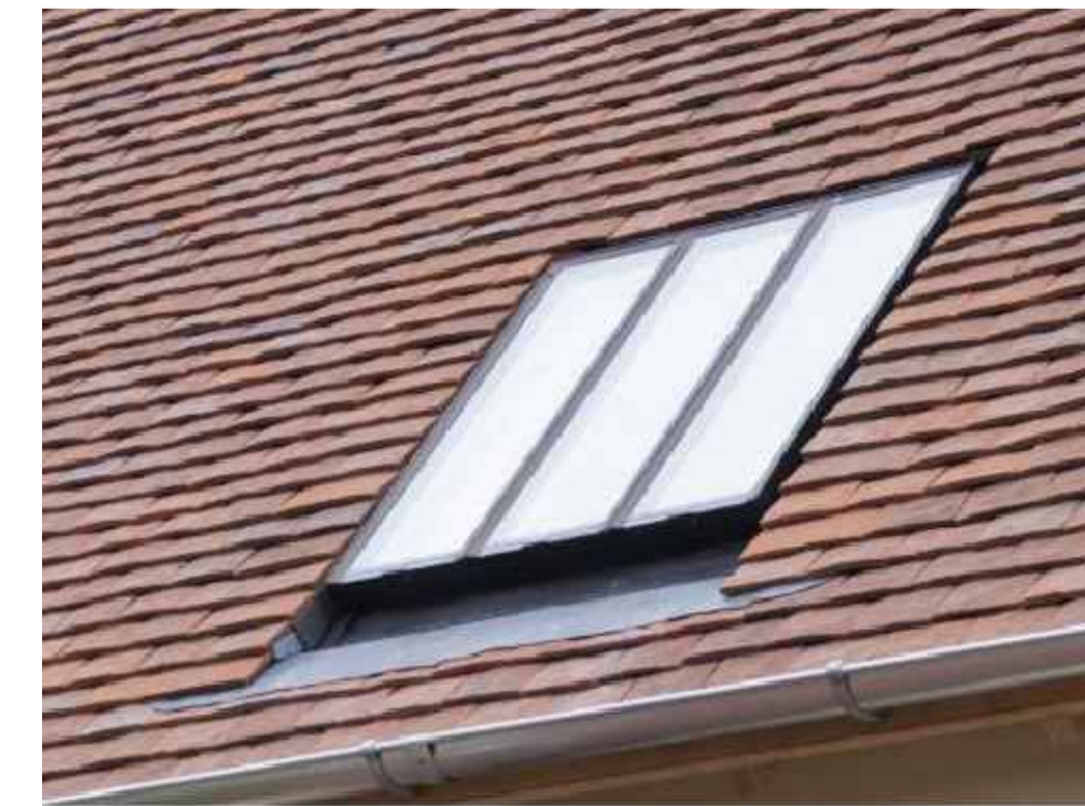
IMAGE REFERENCE - DOUBLE GLAZED 'CONSERVATION' ROOF LIGHTS