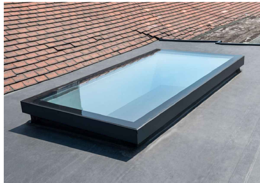
IMAGE REFERENCE - SLIMLINE DOUBLE GLAZED FLAT ROOF LIGHTS