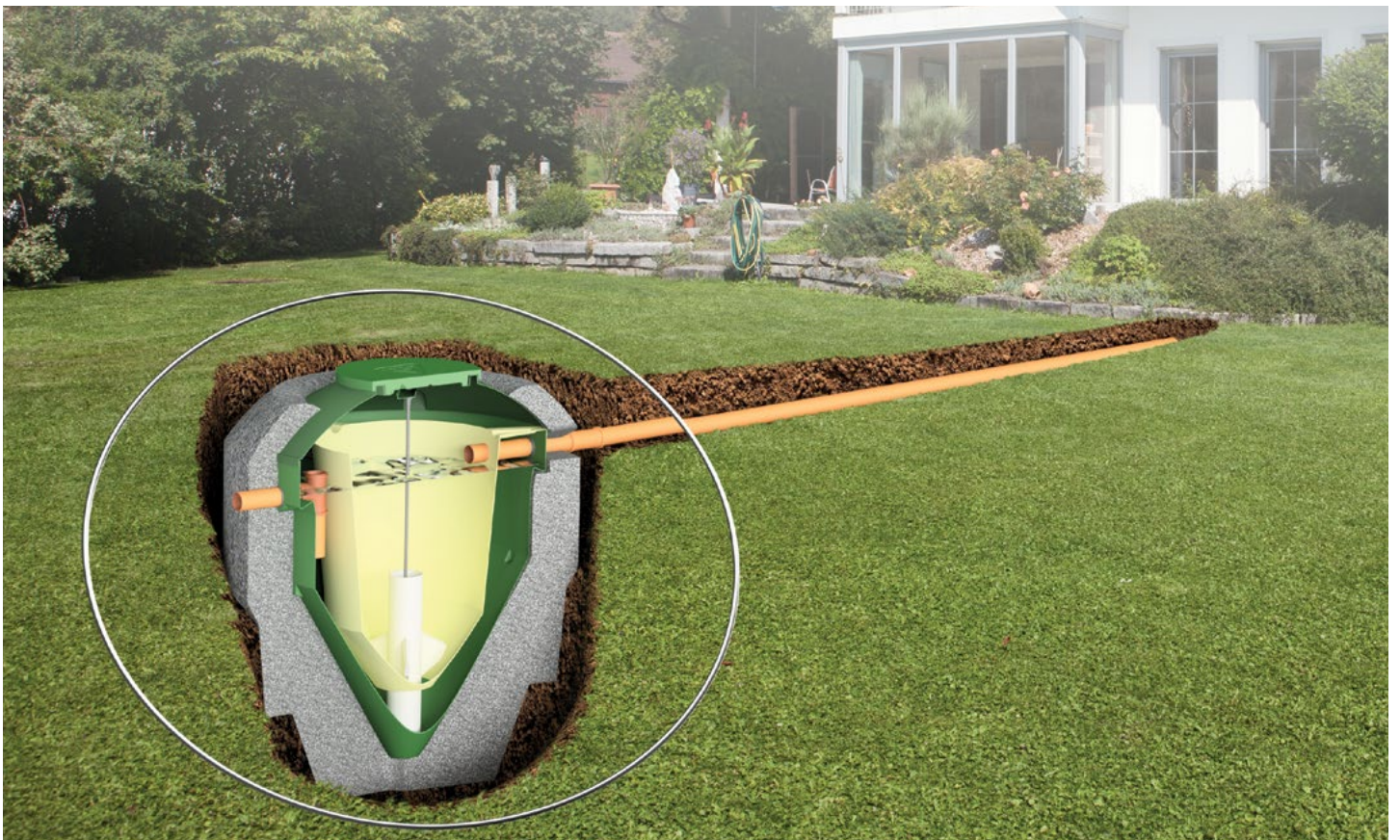
Illustration not to scale