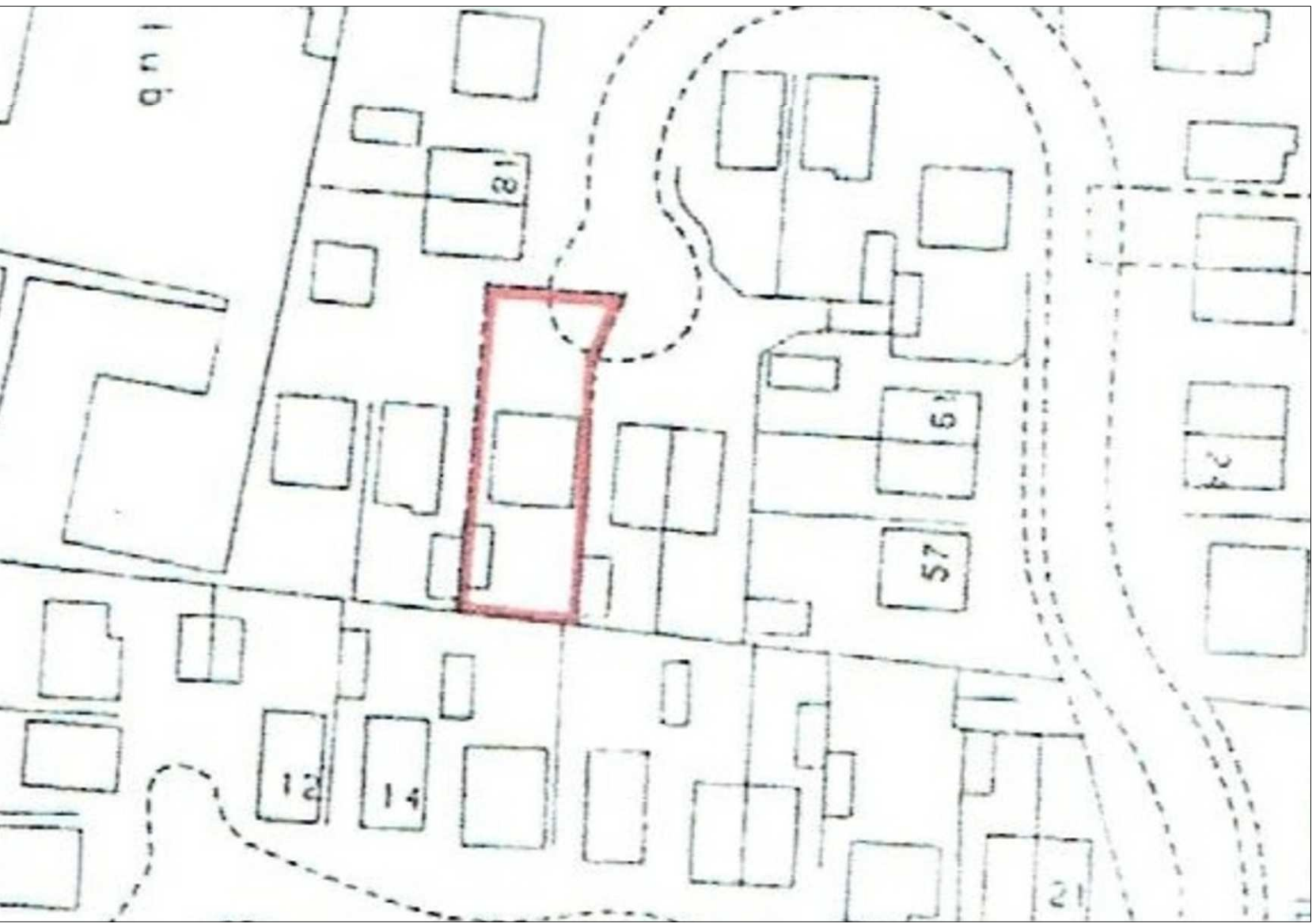
Existing block plan