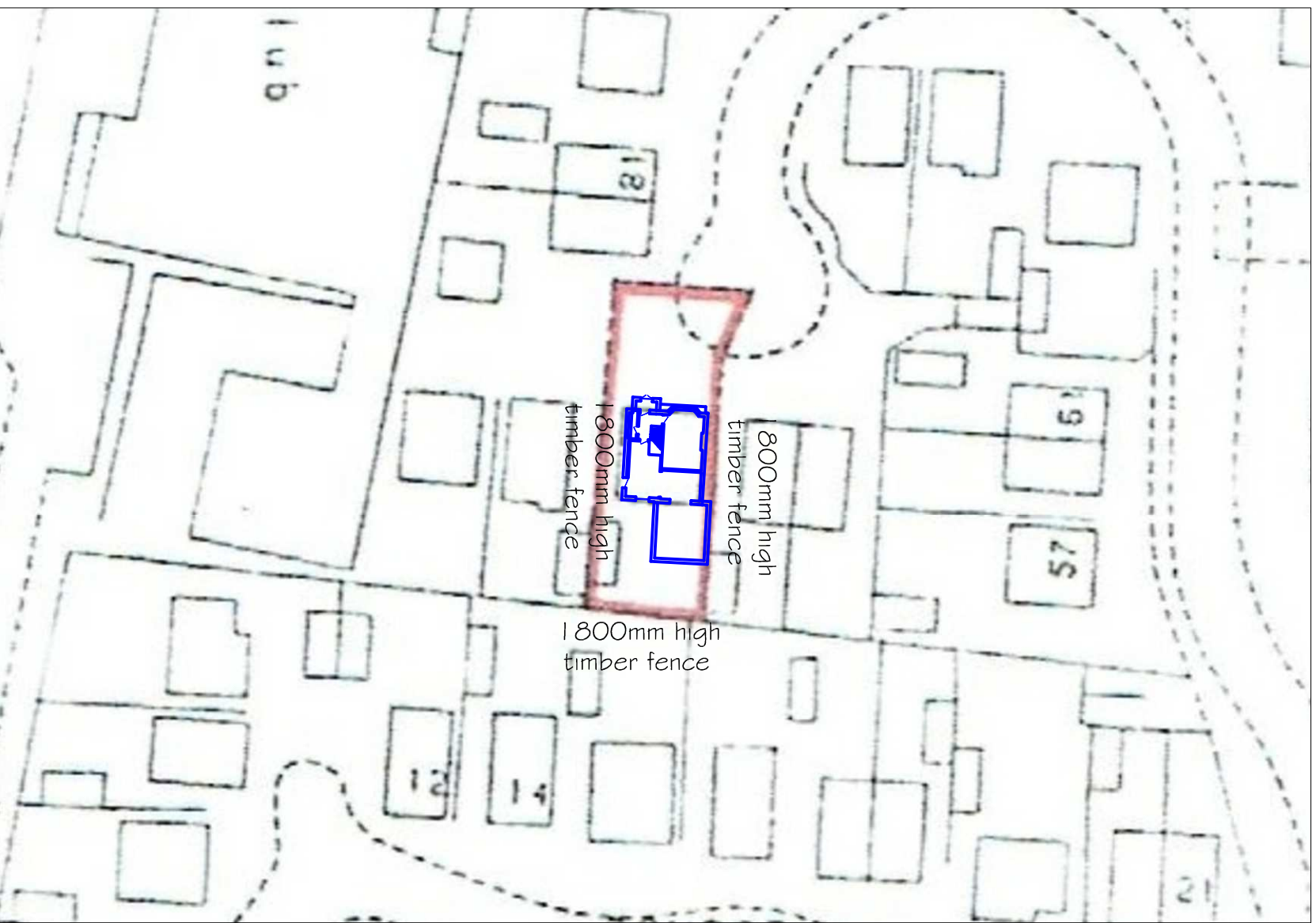
Proposed block plan