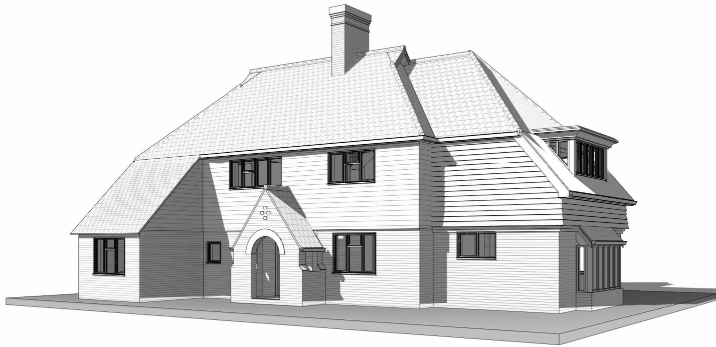
1 Front View