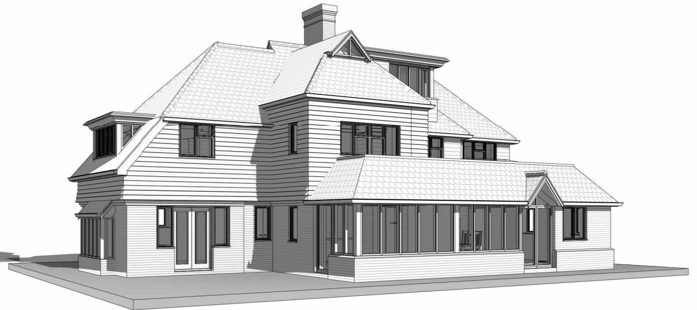
2 Rear View