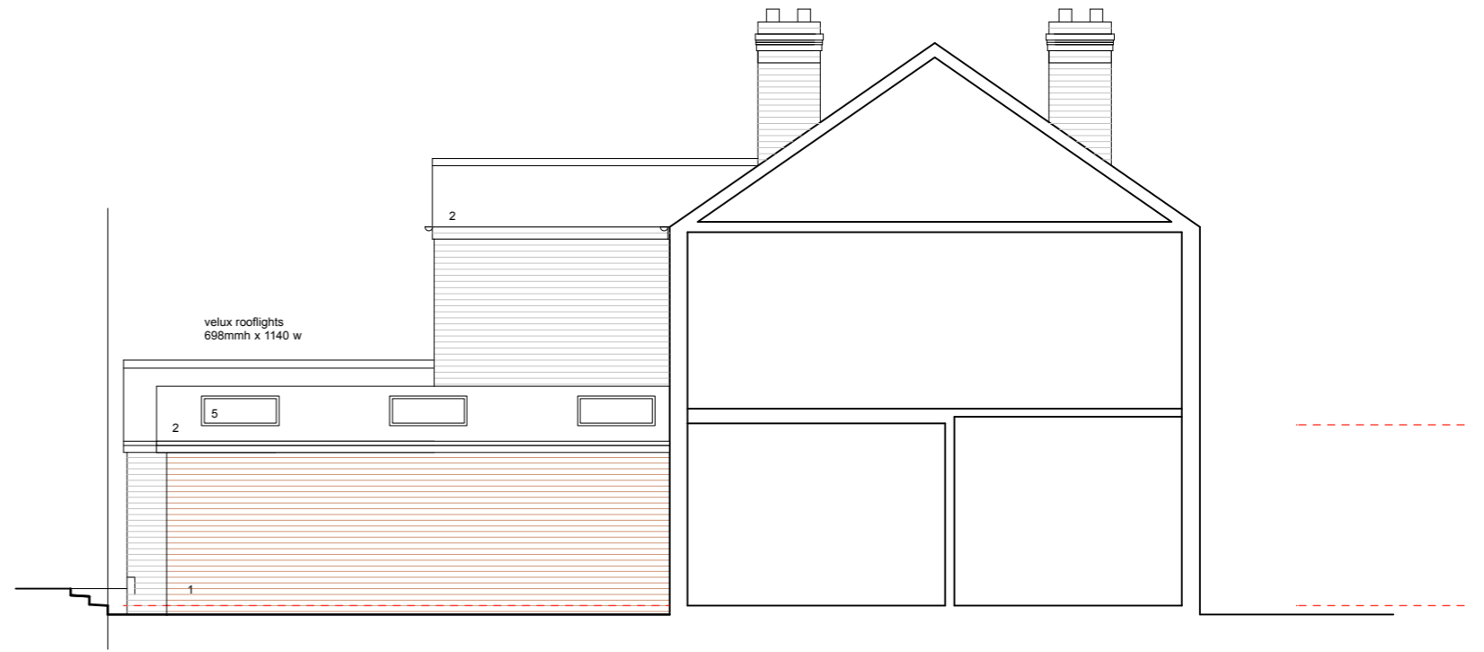
Proposed Side (South East) Elevation