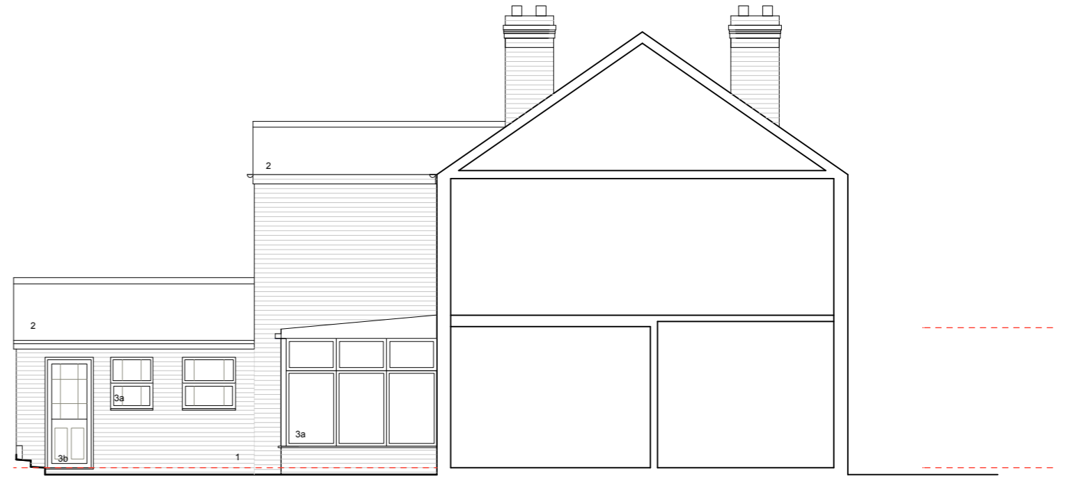
Existing Side (South East) Elevation