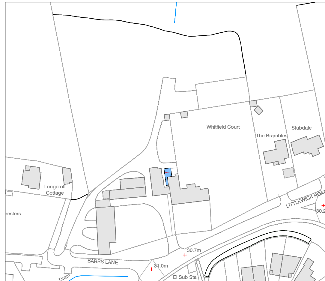
Block Plan scale 1:1250