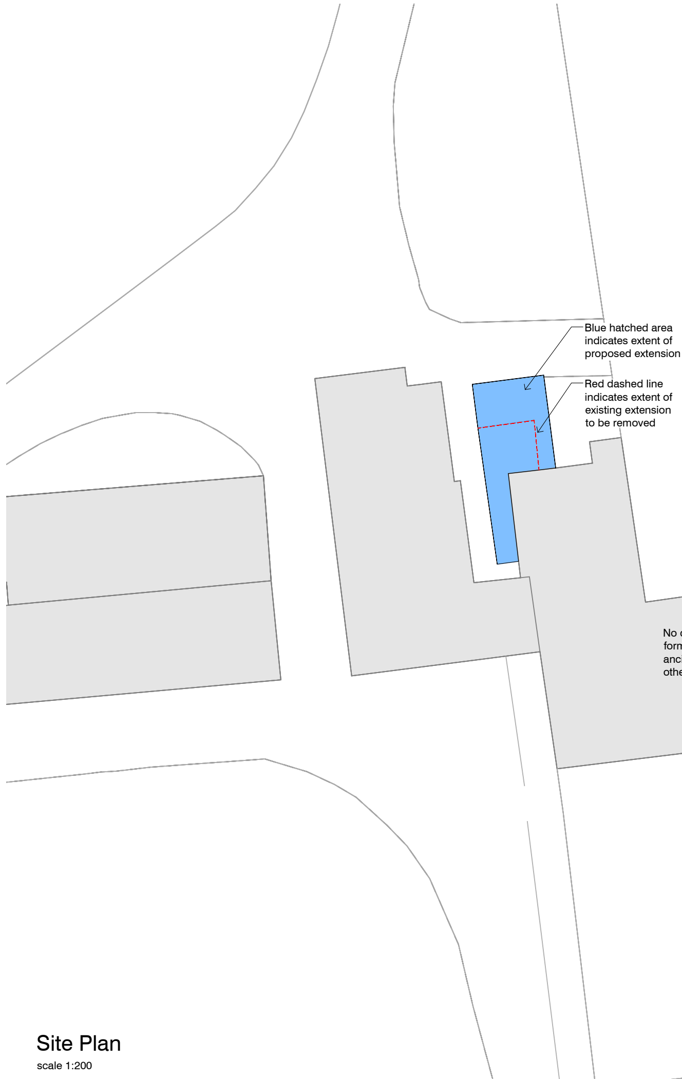
Site Plan scale 1:200

Crown Copyright and database rights 2024 OS 100047474