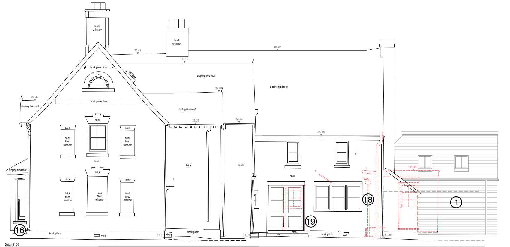
East Elevation scale 1:100

NOTES: Dimensions to be checked on site before commencing work. any discrepancies shall be reported to Curtis Leeves Technical Ltd. immediately. Do not scale from these drawings except for planning purposes. Use figured dimensions only. Where applicable this drawing is to be read in conjunction with other consultants' drawings. This drawing is the copyright of Curtis Leeves Technical Ltd. and may not be copied, altered or reproduced in any way, or passed to a third party, without written authority.