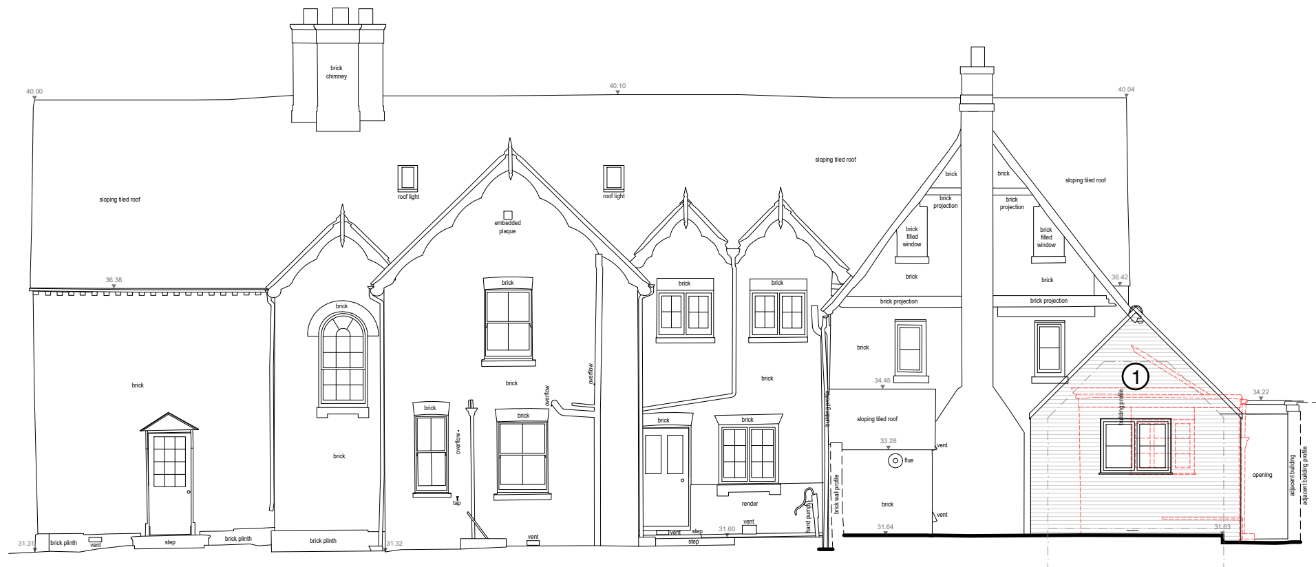
North Elevation scale 1:100