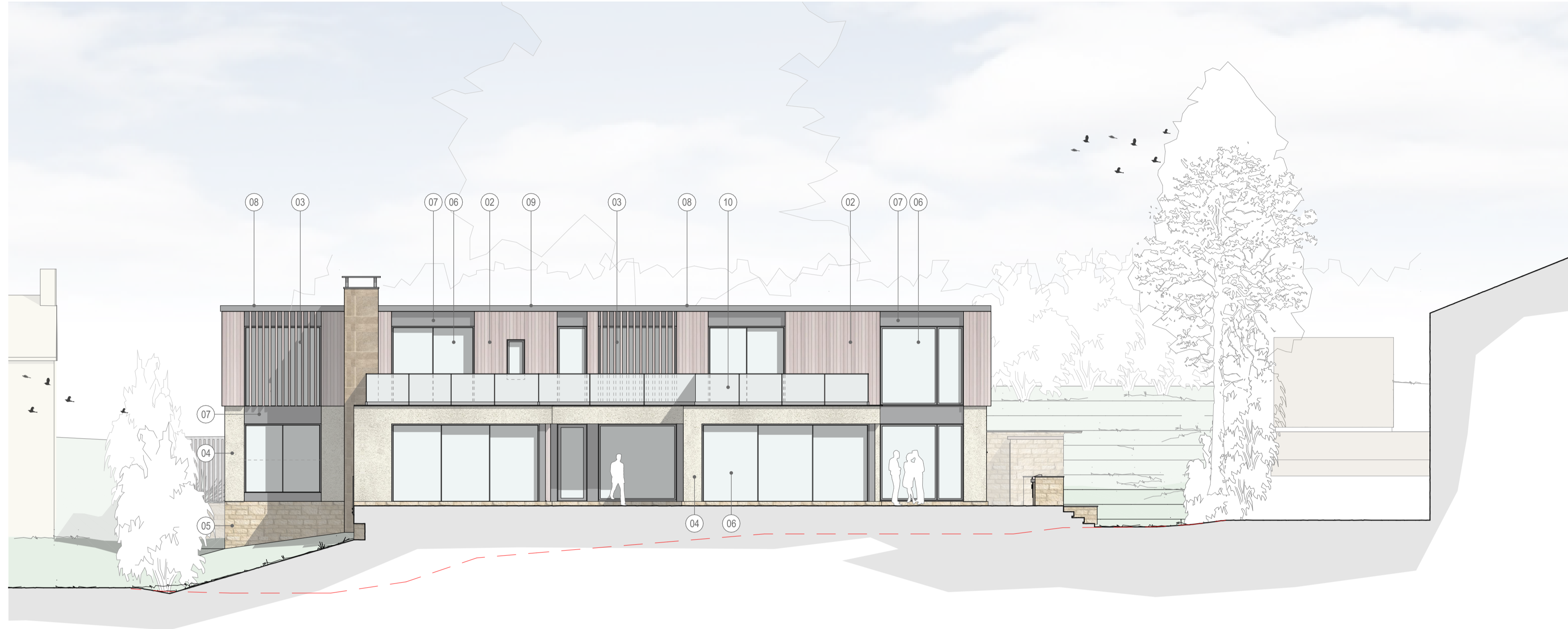
05. Elevation Rear (North West Facing)