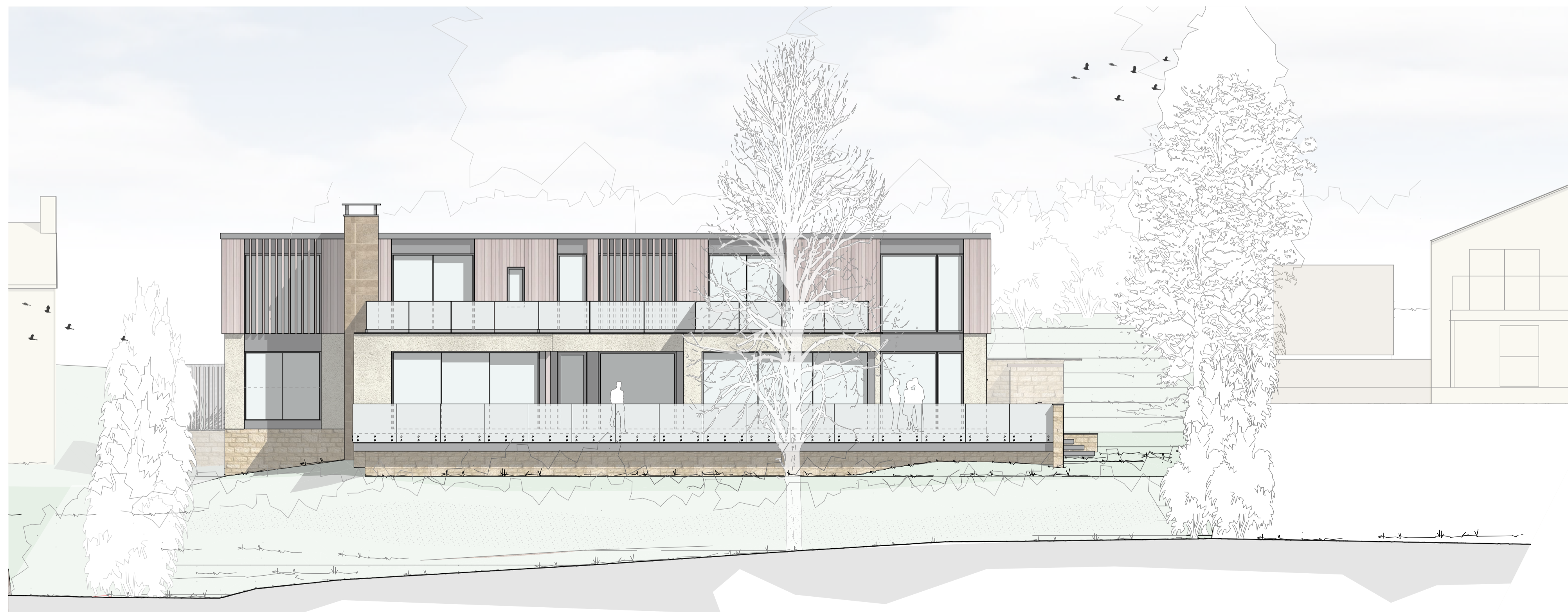
06. Elevation Rear (North West Facing - Section at low garden level)