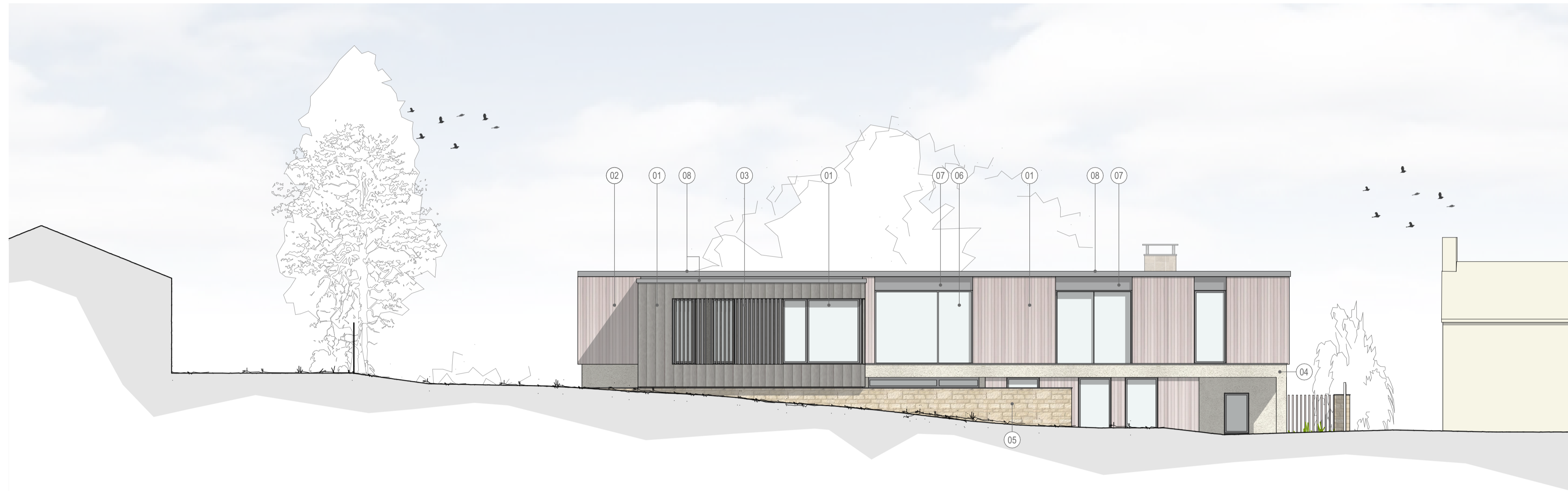
01. Elevation Front (South East Facing)