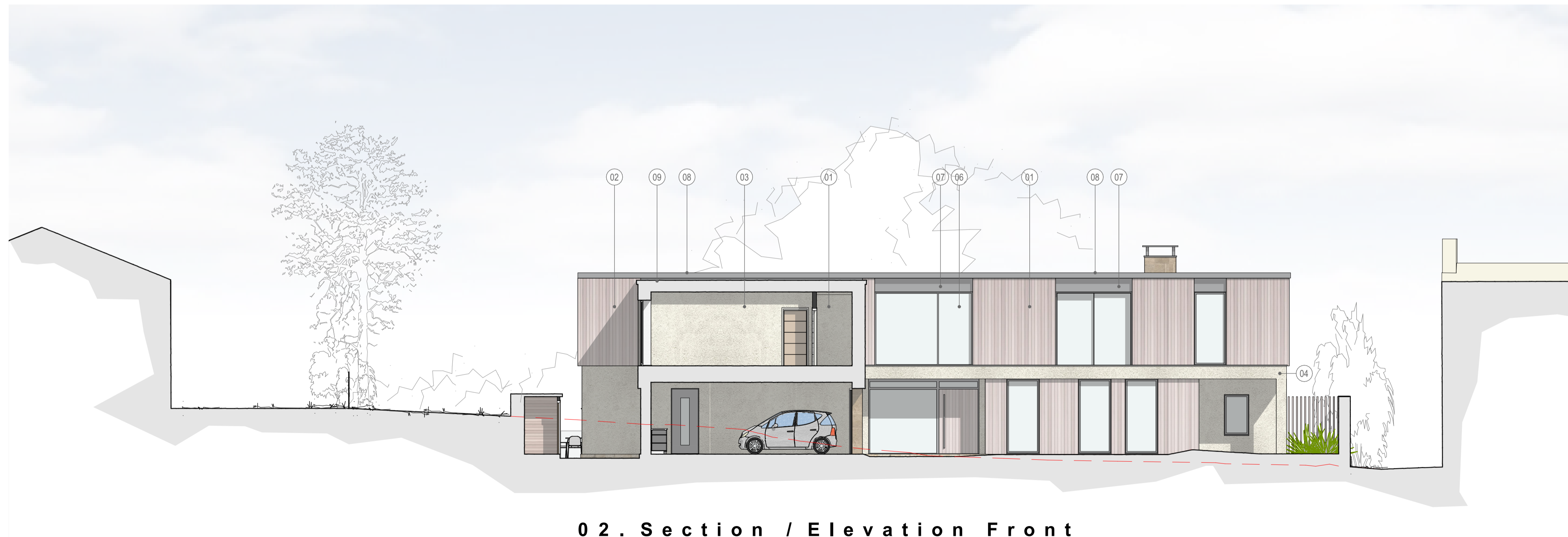
02. Section / Elevation Front (South East Facing - Section beyond retaining wall)