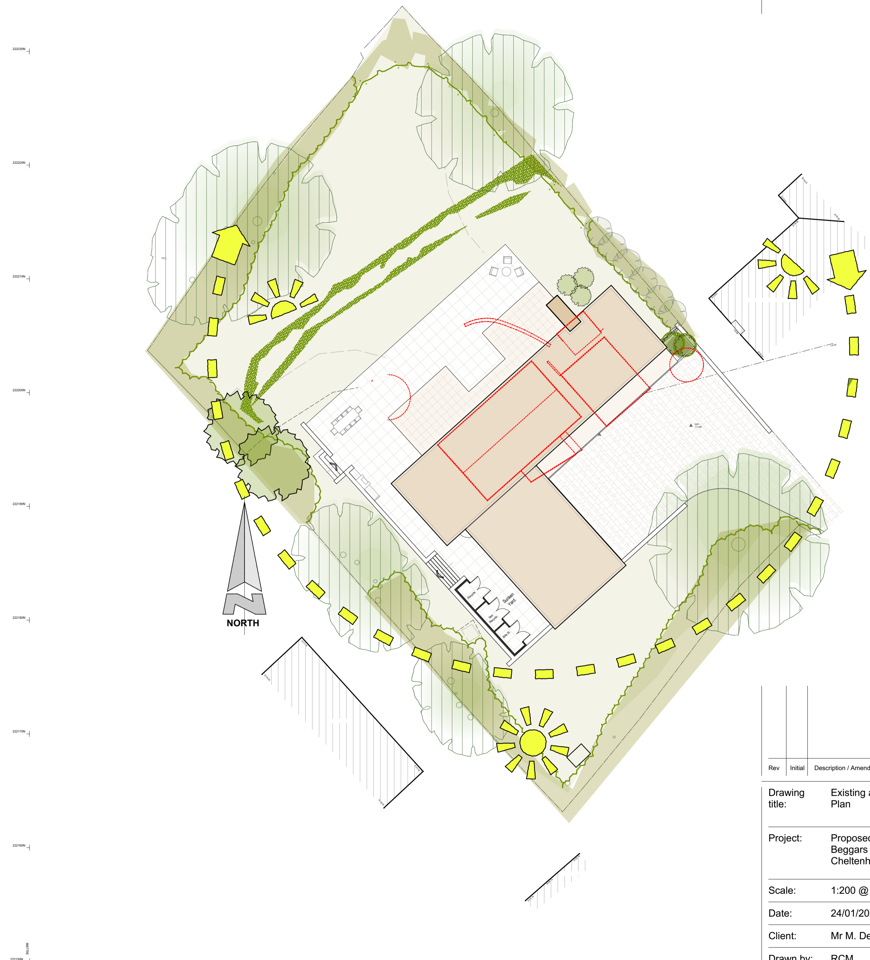
Site plan as proposed