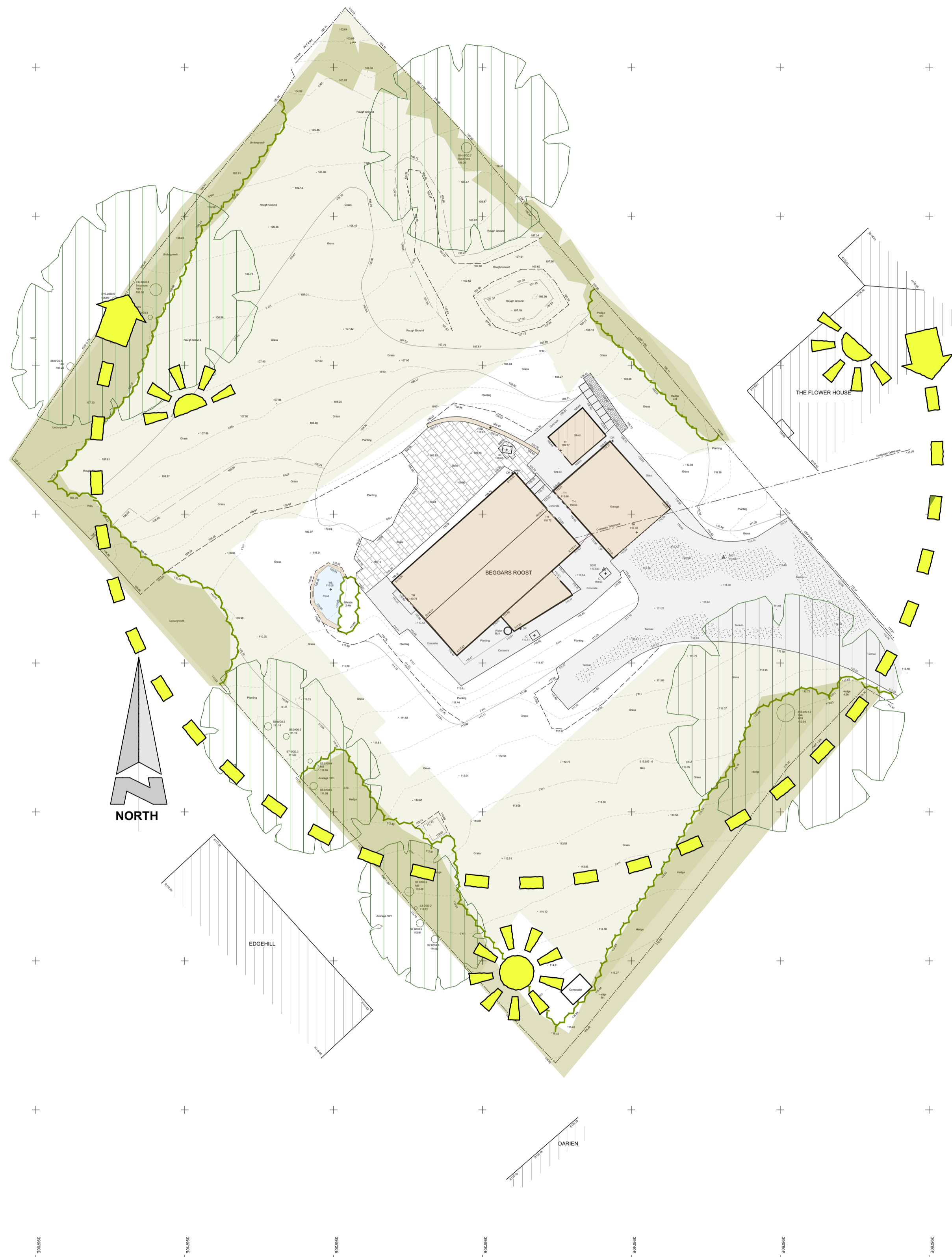
Site plan as existing