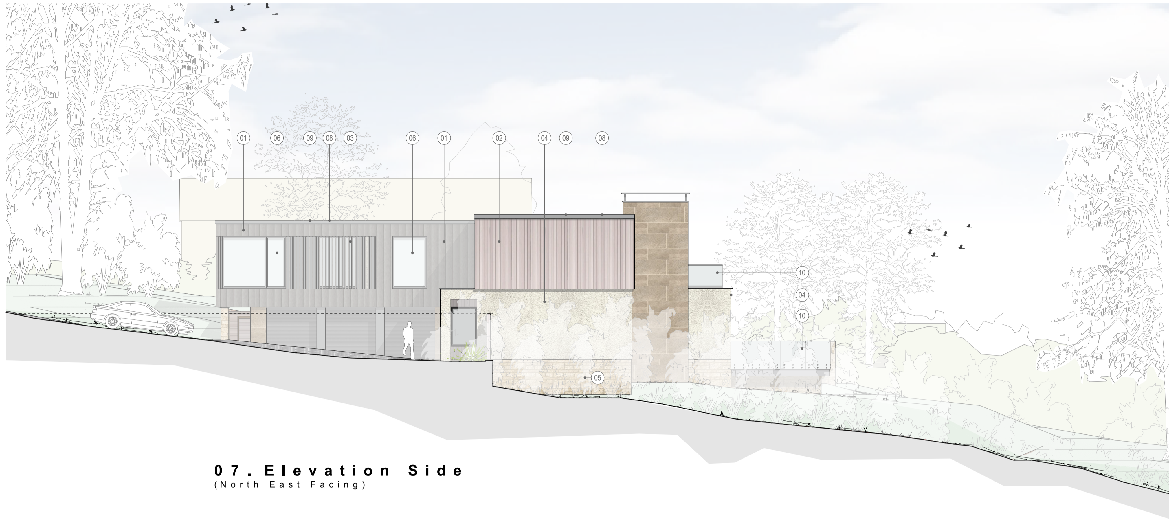
07. Elevation Side (North East Facing)