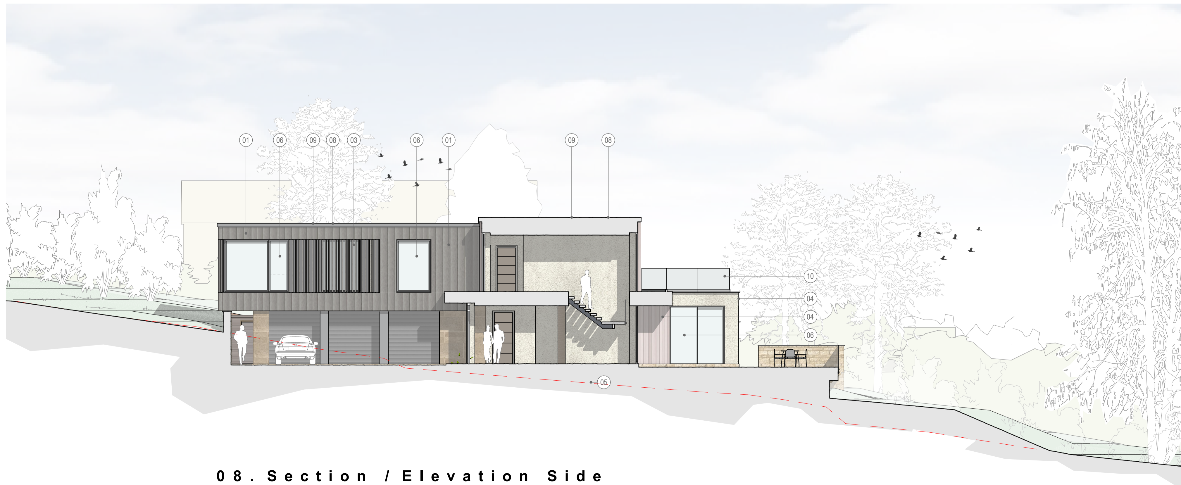
08. Section / Elevation Side (North East Facing - Section through entrance hall)